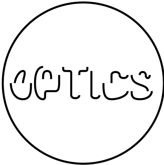
Figure 1. Word “optics” “written” on an atom in (Bromage and Stroud, 1999).

Let us estimate total amount of information that hypothetically conscious electron might contain in its consciousness. This estimation is not a trivial problem. In fact, the statement “electron subjectively observes its quantum dynamics” may be understood twofold. There may be two radically different versions of single particle consciousness hypothesis.