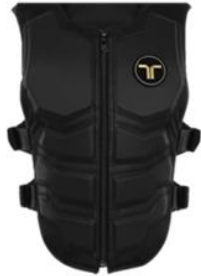
A 'B Haptics' Haptic Vest that uses vibrotactile stimulation to manipulate tactile perception