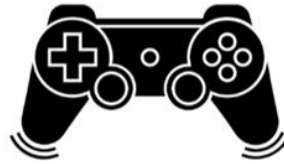
An illustration of vibrotactile haptic feedback from a video games controller