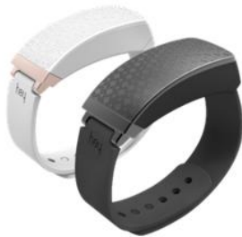
A 'Hey Bracelet' that uses vibrotactile feedback to facilitate long-distance tactile communication