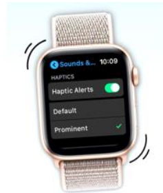
An Apple Watch's haptic feedback settings.