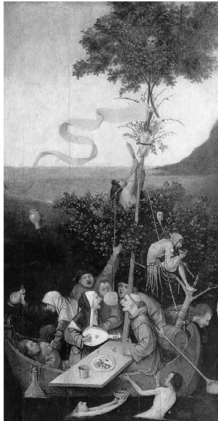
Fig. 1. Hieronymus Bosch, Ship of Fools (1490–1500)

If you're reading the e-book, you can click on the image below to go directly to our donations site. Any amount, no matter the size, is appreciated and will help us to keep our ship of fools afloat. Contributions from dedicated readers will also help us to keep our commons open and to cultivate new work that can't find a welcoming port elsewhere. Our adventure is not possible without your support. Vive la open-access.