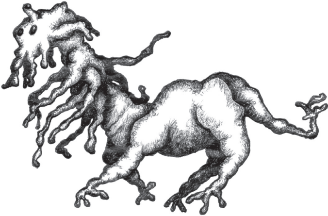
Figure 1: A Less Humanoid Centaur

Control through hegemony isn't necessarily as "civilized" or humane as Machiavelli's centaur analogy suggests, and much more pervasive. The "centaur" in this figure better captures those aspects of Gramsci's theory. (Illustration: Ka Ketelmug, 2016.)