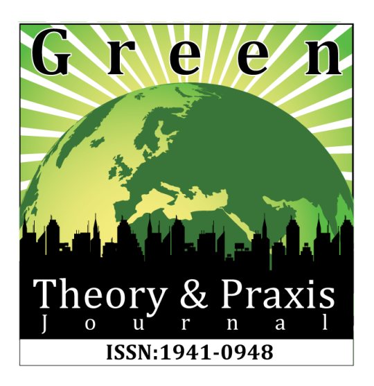
Vol. 14, Issue 1 April 2022