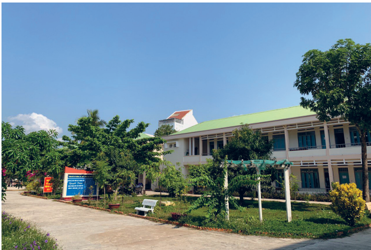
Photo: The compulsory quarantine area for Vietnamese citizens who came back from overseas.

Vietnam does not look at COVID-19 as the challenge in violation of our citizens' freedom. What we are learning from the event is the importance of our country's unity.