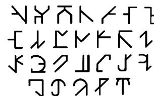
Fig. 1 Pseudoletters used in experiments 1 and 2

T2 was presented at one of three lags after T1: 100, 300, or 900 ms, i.e., lags 1, 3, and 9, respectively. The lag was selected randomly on each trial, with the constraint that there was an equal number of trials per lag. Pseudoletter distractors continued to be presented during the inter-target lag. The RSVP stream ended with a 7-ms presentation of T2. The sequence of events on any given trial is illustrated in the left-hand panel of Fig. 2 . In the present context, the