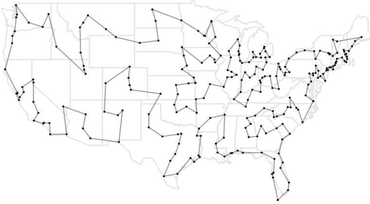
Figure 4: The shortest path I could find, with a distance of 20301 miles.