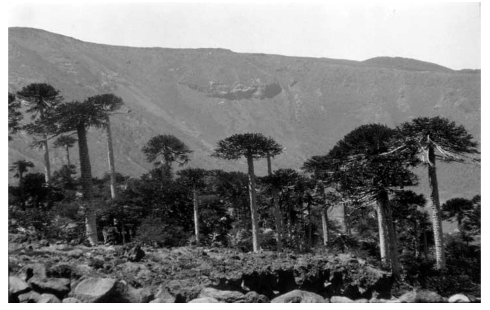
Figure 2. Mature monkey-puzzle trees.

ological stations in the area yield a mean January temperature of 17 \,^{\circ} C and a mean July temperature of 4 \,^{\circ} C, although monkey-puzzle is capable of withstanding much more pronounced extremes (Montaldo, 1974).