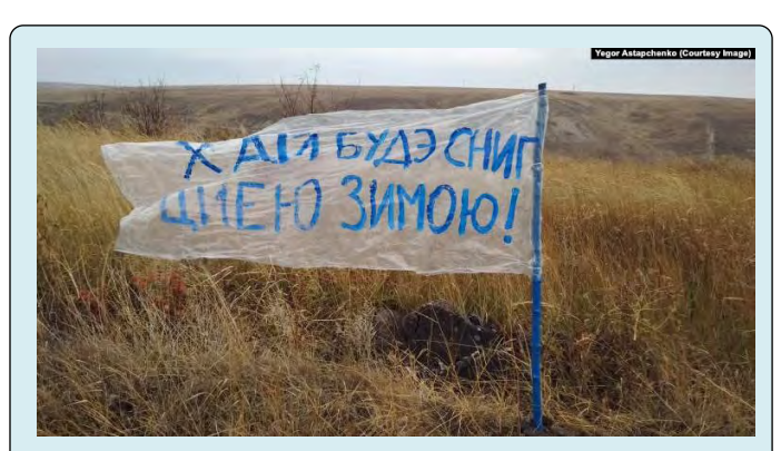
Figure 5: Yegor Astapchenko, The Language of Limestone Spaces, 2022, polyethylene founded on the banks of the river Tikhaya Sosna (Pacific Pine), acrylic, wood, various dimension, author curtsey, Voronezh, Russia.

"You can never understand one language until you understand at least two." - Geoffrey Willans