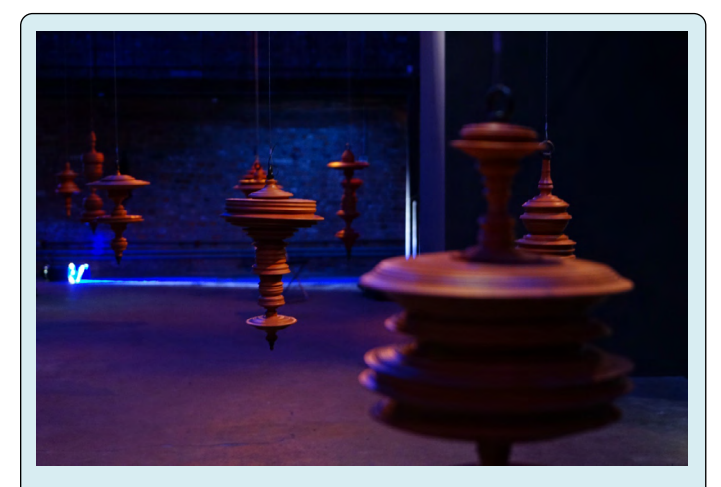
Figure 2: Sergei Katran, Until the Word is gone, 2016, terracotta, various dimension, author curtsey, Moscow, Russia.

ancient technique, which refer to the dawn of culture and civilization, hang in the air thus creating a media-poetical, nonverbal art space, where each object is valuable in itself and autonomous, yet together they give birth to a symphony composed of a single word. The paradoxical harmony of word and image, their unexpected accordance presents us with a conceptualization of sound. The artist, as he focuses our attention on the way the sound of words is visually constructed, endows the construction with tangible fragility, a possibility of crashing into pieces only leaving behind potsherds (Figure 2).