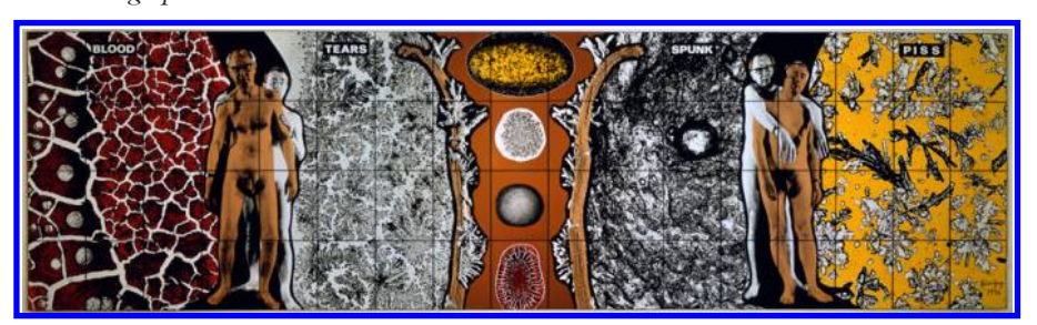
Figure 1. Gilbert and George, Blood Tears Spunk Piss , 1996. Courtesy of the Artists, Lehmann Maupin Gallery, New York and Sonnabend Gallery, New York.