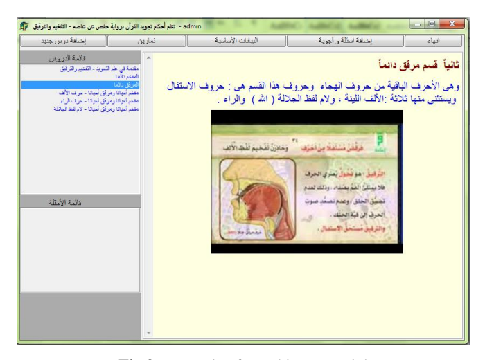
Fig 9: Example of Teaching Material