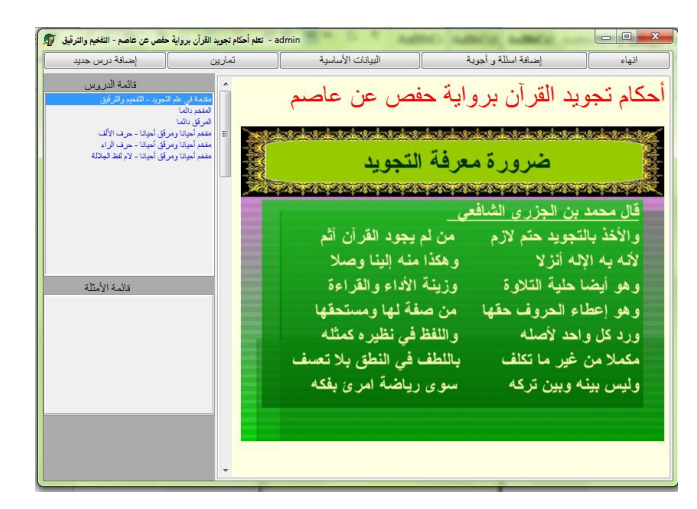
Fig 4: Example of Teaching Material