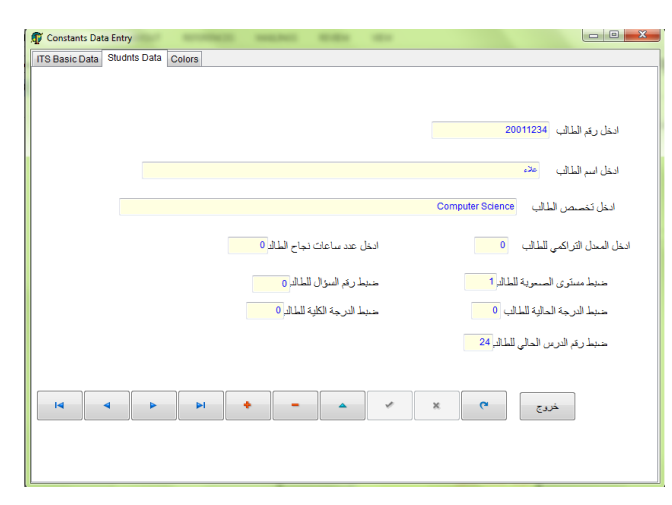
Fig 5: Form for adding students' data