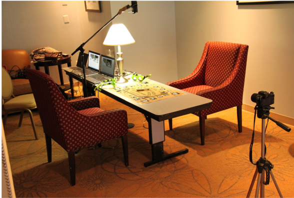
Fig. 1 The experimental setup