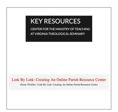
Link By Link: Creating An Online Parish Resource Center