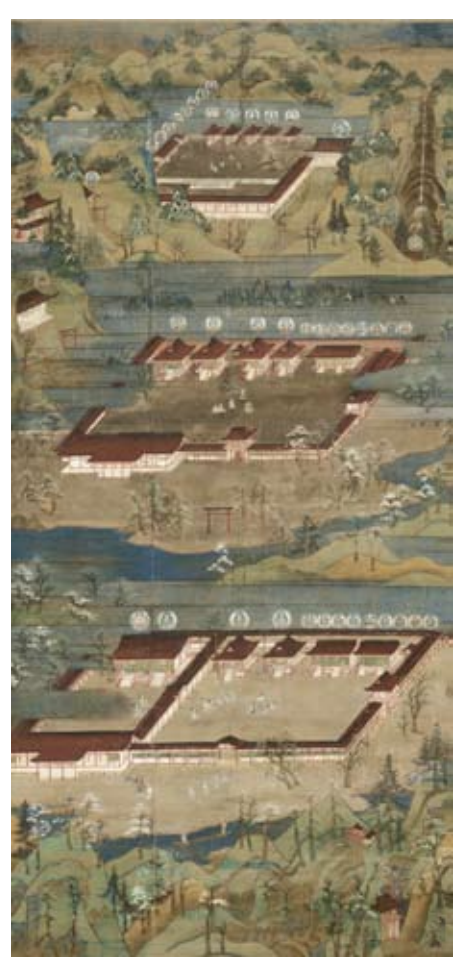
FIGURE 3: Kumano Mandara, Kamakura period, fourteenth century, hanging scroll, ink, and color on silk, 134 x 62 cm.

The projection of Buddhist paradise onto the actual geography offered pilgrims the opportunity to physically experience the "Pure Land" which was often located in the midst of awe-inspiring natural beauty. In particular, the pilgrimage to Kumano, the earthly paradise of Kannon, is a well documented phenomenon, supported by records of frequent imperial pilgrimages from the late Heian period.8