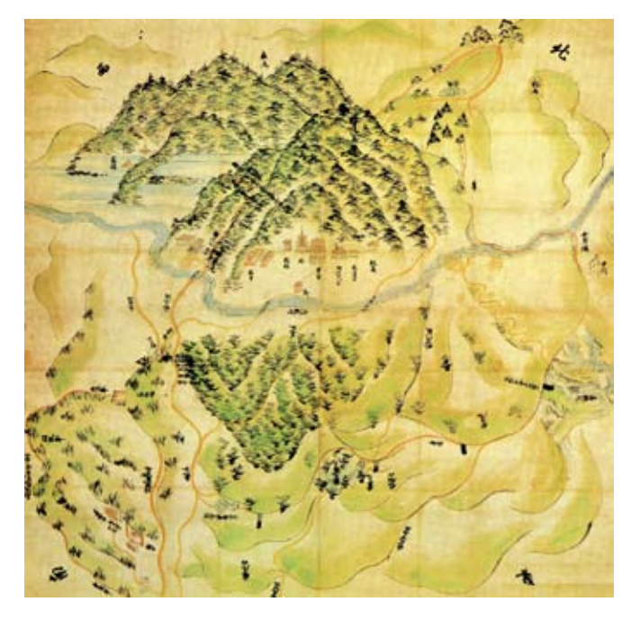
FIGURE 6: Kōzanji map, 1230, ink and color on paper, 164.7 x 164.4 cm. Jingoji, Kyoto.

The high viewpoint also allowed the distance and orientation of buildings to be shown fairly accurately, providing an easy-to-read ground plan of the site. These characteristics are sometimes described as "map-like", but a comparison between miya mandara and echizu (picture map) reveals a fundamental difference in viewpoint. The map of Kōzanji 高山寺, dated 1230, is a representative example of a medieval map made for a practical purpose (FIGURE 6). It records the territorial boundaries of the Kōzanji temple, as officially verified by the Dajōkan 太政官 after the land was granted to the priest Myōe 明恵 (1173–1232) by Emperor Gotoba 後鳥羽 (1180-1239) in 1206 (SHIMOSAKA 2003, 428). The boundary is shown in red with a few black bōji 膀示 (markers) attached to the line, and the four cardinal directions are inscribed in the four corners of the map. The temple halls and a pagoda are shown in the center, each labelled underneath,