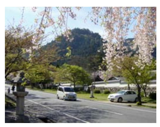
FIGURE 5: Mount Hachiōji, Hie Shrine.

The distinct division between the landscape and the figures of deities at the top of the composition indicates the artist's intention to treat the location as a realistic landscape. There is no human figure in the shrine complex, and the landscape is enveloped in lush green trees and a tranquil air. The main subject matter of the painting is clearly Mount Hachiōji in the center, with two small shrines, Hachiōji and San no miya 三宮 perched near the summit. In comparison to the gentle slope of the real mountain (FIGURE 5), the height of the painted mountain is exaggerated in order to emphasize the role of the mountain as the