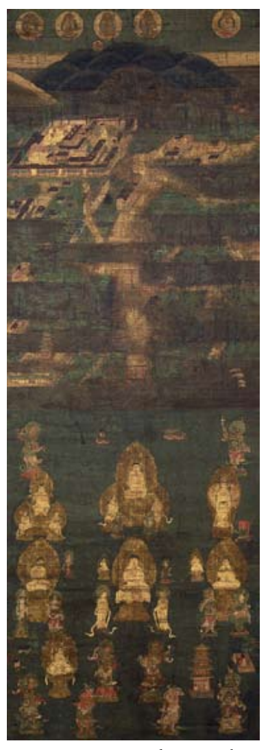
FIGURE 2: Kasuga Mandara, Kamakura period, fourteenth century, hanging scroll, ink, color and gold on silk, 99.8 x 35 cm. The British Museum.

The lower half of the painting in contrast displays a more schematic structure of honjibutsu mandara , which depicts Buddhist deities arranged in orderly rows on a plain background. The hierarchical organization with the most important deity in the center (in this case, Śākyamuni, the honji of the First Shrine) conforms to the geometric structural principles of esoteric