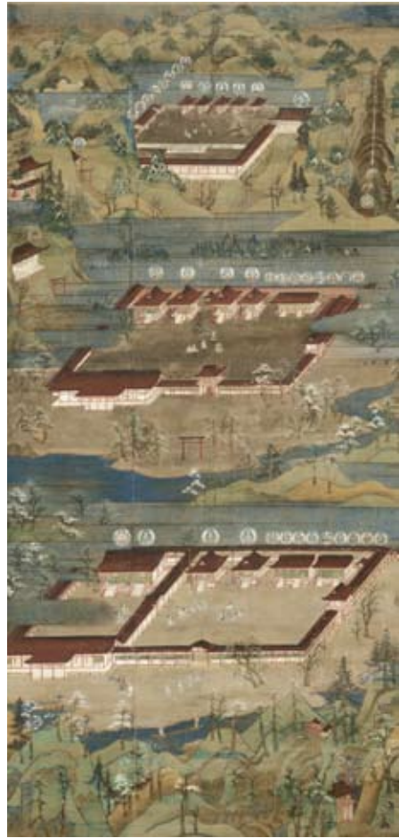
FIGURE 3: Kumano Mandara , Kamakura period, fourteenth century, hanging scroll, ink, and color on silk, 134 x 62 cm.

However, as already noted the proliferation of shrine-related mandara only gathered pace in the second half of the Kamakura period. Visual records such as the fourteenth-century Kumano mandara in the Cleveland Museum of Art (FIGURE 3) and a section from Ippen hijiri-e (dated 1299) convey to us the popularity of pilgrimage that fulfilled the pious desire in the context of both Buddhist and the worship of kami. The concluding chapter from the aforementioned Kasuga