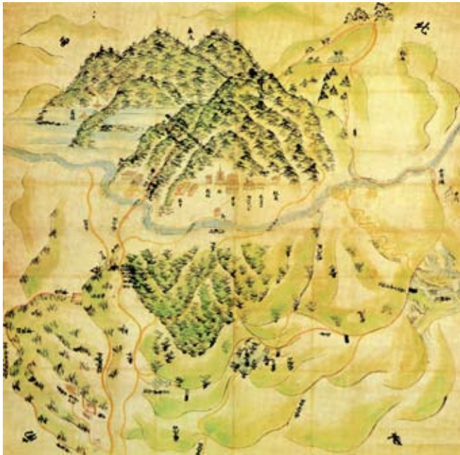
FIGURE 6: Kōzanji map, 1230, ink and color on paper, 164.7 x 164.4 cm. Jingoji, Kyoto.

The high viewpoint also allowed the distance and orientation of buildings to be shown fairly accurately, providing an easy-to-read ground plan of the site. These characteristics are sometimes described as “map-like”, but a comparison between miya mandara and echizu (picture map) reveals a fundamental difference in viewpoint. The map of Kōzanji 高山寺, dated 1230, is a representative example of a medieval map made for a practical purpose (FIGURE 6). It records the territorial boundaries of the Kōzanji temple, as officially verified by the Dajōkan 太政官 after the land was granted to the priest Myōe 明恵 (1173–1232) by Emperor Gotoba 後鳥羽 (1180–1239) in 1206 (SHIMOSAKA 2003, 428). The boundary is shown in red with a few black bōji 勝示 (markers) attached to the line, and the four cardinal directions are inscribed in the four corners of the map. The temple halls and a pagoda are shown in the center, each labelled underneath,