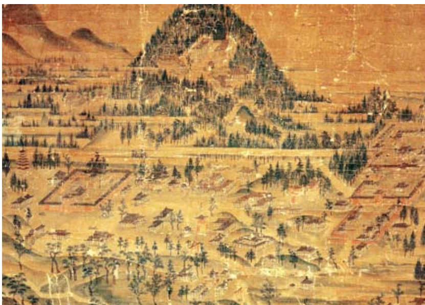
FIGURE 4: Hie Sannōsha kozu , Muromachi period, hanging scroll, ink and color on paper, 52.9 x 71.8 cm. Enryakuji.

It has been noted that the calendrical cycle's Chinese character combination for the first date 1447 is incorrect and the word "Saitō" 西塔 (Western Pagoda) may be a mistake for "Tōto" 東塔 (Eastern Pagoda). 17 (BIWAKO BUNKAKAN 1991, 33). As it was quite common for medieval paintings to be attributed to a certain painter or to a certain date during the Edo period, long after its actual creation, it is hazardous to accept the dates mentioned in the inscription as a reliable record. Therefore the dating of the mandara needs to be addressed from several angles.