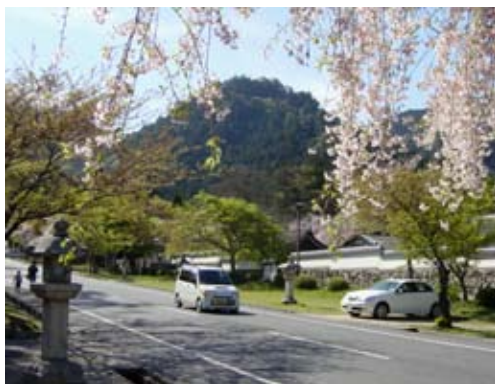
FIGURE 5: Mount Hachiōji, Hie Shrine.

The distinct division between the landscape and the figures of deities at the top of the composition indicates the artist's intention to treat the location as a realistic landscape. There is no human figure in the shrine complex, and the landscape is enveloped in lush green trees and a tranquil air. The main subject matter of the painting is clearly Mount Hachiōji in the center, with two small shrines, Hachiōji and San no miya 三宮 perched near the summit. In comparison to the gentle slope of the real mountain (FIGURE 5), the height of the painted mountain is exaggerated in order to emphasize the role of the mountain as the