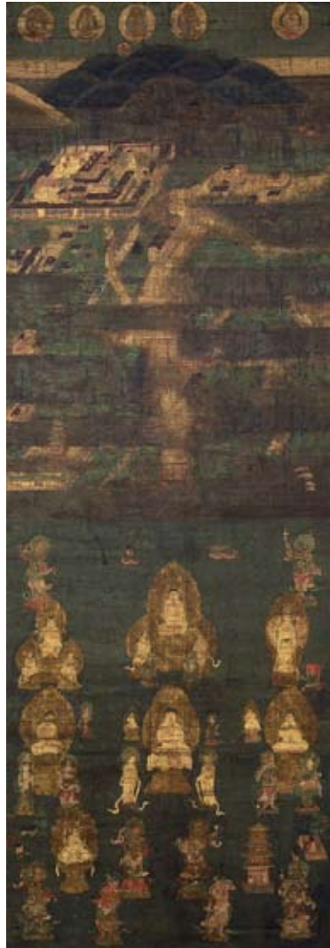
FIGURE 2: Kasuga Mandara , Kamakura period, fourteenth century, hanging scroll, ink, color and gold on silk, 99.8 x 35 cm. The British Museum.

The lower half of the painting in contrast displays a more schematic structure of honjibutsu mandara , which depicts Buddhist deities arranged in orderly rows on a plain background. The hierarchical organization with the most important deity in the center (in this case, Śākyamuni, the honji of the First Shrine) conforms to the geometric structural principles of esoteric mandalas, such as the Ryōkai mandara introduced to Japan by Saichō and Kūkai in the ninth century. In this image, the physical geography of the shrine landscape is juxtaposed with the metaphysical world of Buddha to convey the idea