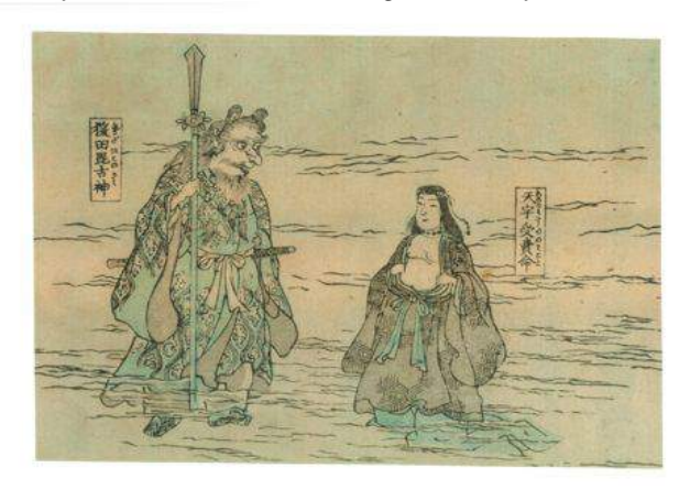
Fig. 3. The attitude of ! miya-no-Me (the right side) on the Eighth Seat of "Hasshinden", drawn by Utagawa Kuniyoshi (Ichimu D" jin [1860]: Nihon-kaibyaku-yuraiki, Vol. 2, Suwaraya Mohei Publisher)

With tardy physical appearance of attracting "harmonious fusion of human minds" of ! miya-no-Me , a warrior gathers all the metaphysical information about "Life or Death" from the opponent's reaction, and it is possible by attacking first prior to the opponent's "take the offensive".