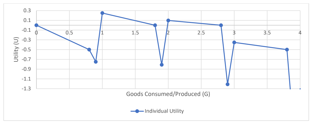
Figure 2: Complex Marginal Utility (for Coconuts)