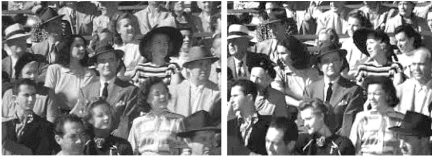
Fig. 3 A scene from Alfred Hitchcock's Strangers on a Train

are.) But it is doubtful whether something can look to have a certain mean size without actually having that mean size. 13 Thus, it is natural to group ensemble properties with high-level properties in certain respects, and it is natural to group them with low-level properties in other respects. We are inclined to think that the high-level/low-level contrast is not sufficiently precise for the question of whether ensemble content is high-level or low-level to have a determinate answer. 14