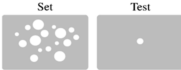
Fig. 1 Example trial in which subjects saw a set of 16 dots with a similarity factor of 1.4 followed by a single test spot (reproduced with permission Ariely 2001: 158)

asked whether the test dot was a member of the set of dots presented in the first interval, and on mean-discrimination trials subjects were asked whether the single test dot was smaller or greater than the mean dot size of the preceding set.