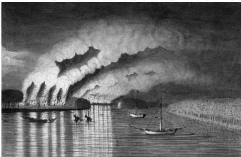
Illustration 2: Thomas Davies, A View of the Plundering and Burning of Grimross, 1758 (National Gallery of Canada).