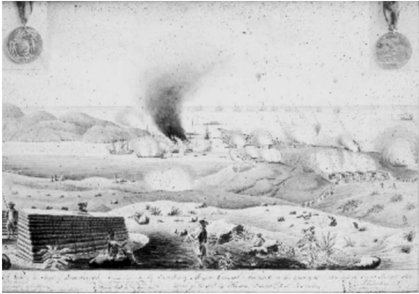
Illustration 1: Thomas Davies, A View of the Siege of Louisbourg , 1758 (National Gallery of Canada).

benefit of the mother country. As well, when Colville painted holocaust victims (1946) he was reflecting on issues of international law and justice in the precise vision of his style of painting. In all of this the artist's mission was to record and comment on war as that mirror that reflected contemporary life about which conflict was but one aspect. The work of Thomas Davies remains an aspect of the eighteenth century that recorded British war with the French in a framework that showed the capability of nations toward cultural achievement even when preoccupied with the realities of war.