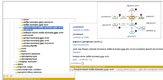
Figure 1: Baltimore Classification in Protégé Editor

Figure 1 illustrates how the Baltimore Classification appears in the Protégé visualization of the class positive-sense single-stranded RNA virus, supplemented by a textbook image of the seven viral replication pathways underwritten by virus genetic differences.