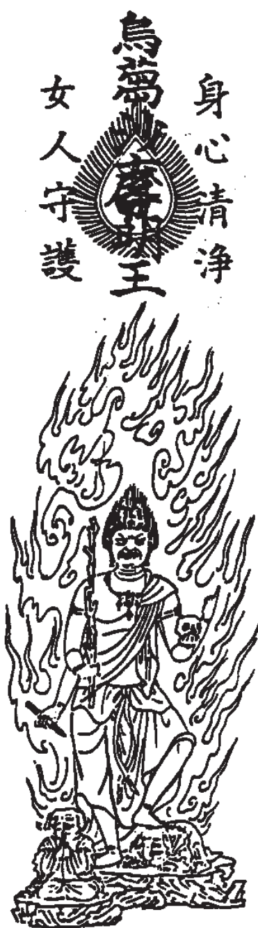
Figure 4. Talisman to ward off “female pollution.”

mental Buddhist principles. Charms formerly issued by Sōtō temples to counter “female pollution” have been banned (see figure 4). Ritual prayers on behalf of aborted fetuses ( mizuko ), the ruler (i.e., tennō 天皇), and “the spirits of the glorious war heroes” ( eirei 英霊) have been publicly repudiated. In 1993 the former Sōtō monk Uchiyama Gudō (1878–1911), who had been stripped of clerical status and executed for his anti-imperial propaganda, was officially rehabilitated (i.e., readmitted to clerical status). In 1992 the Sōtō Headquarters published an official acknowledgment of guilt for its role in supporting military conquest and an apology for the activities of Sōtō missionaries in occupied territories, especially Korea. Major Sōtō temples now perform annual memorial rites on behalf of the victims of Sōtō religious discrimination and Japanese military aggression (SŌTŌSHŪ JINKEN YŌGO SUISHIN HONBU 1994a).