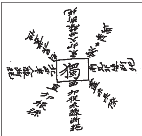
Figure 2. Special talisman for protection from deceased outcasts.

Third, the history of social discrimination in Sōtō Zen, and in Japanese Buddhism as a whole, did not begin with Tokugawa government policies. If government policies alone set the pattern for subsequent forms of social discrimination, then one might reasonably expect to find similar types of discrimination nationwide wherever Sōtō temples exist in proximity to outcaste ghettos. Instead, wide variation seems to be the rule. Likewise, even before the 1635 implementation of the temple registration system Sōtō Zen teachers already had developed special funeral rituals for people of “non-human” ( hinin 非人, i.e., outcaste) status as well as for victims of mental illness, leprosy, and other socially unaccepted diseases. Secret initiation documents, generally known as “ Hinin indō no kirikami ” (the earliest known example of which is dated 1611; see figure 1), describe the