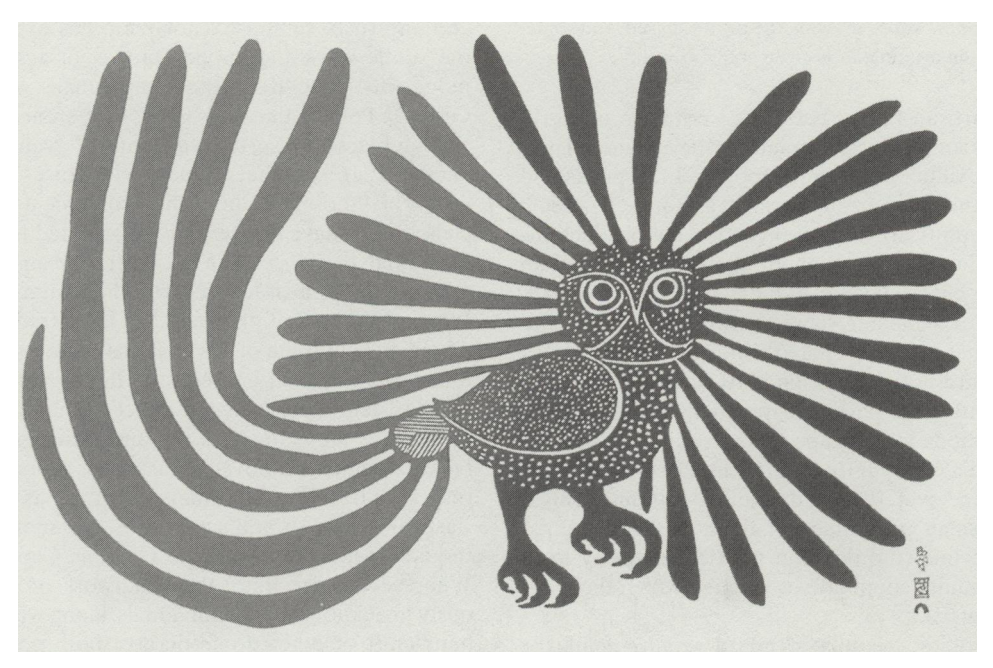
FIGURE 3. Kenojuak Ashevak (1927–2013). The Enchanted Owl (1960). Stonecut on paper. 60.9 cm. x 66 cm.

presumably only visual evidence-undetected when he thought the work was painted by David-that the work was clearly deficient. "Its poetry, literary rather than plastic, its very evident charms, and its cleverly concealed weaknesses, its ensemble made up from a thousand subtle artifices, all seem to reveal the feminine spirit."33 This type of devaluing of an art object by a supposedly objective, knowledgeable judge is not an isolated incident. In numerous cases where the aesthetic value is low. there is an implicit judgment about the maker -and his or her lack of artistic qualificationslurking behind the aesthetic judgment. Originality is opportunistically used to cite Charpentier as a mere imitator, a student of David. Similar accusations have been made against seventeenthcentury painter Judith Leyster whose works lost value upon discovery of a brushstroke style which was criticized as imitative of Frans Hals. More recently, Lee Krasner's reputation suffered because of her being both the wife and imitator of her husband, Jackson Pollock; Elaine de Kooning also fared badly in comparison to Willem.