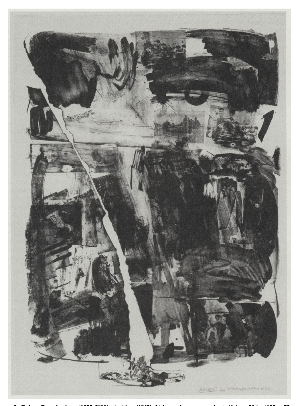
FIGURE 2. Robert Rauschenberg (1925–2008). Accident (1963). Lithograph on paper; sheet: 41 in. x 29 in. (105 × 75 cm). Publisher/Printer: Universal Limited Art Editions, West Islip, New York. Gift of the Celeste and Armand Bartos Foundation. The Museum of Modern Art, New York, NY, U.S.A. Art © Robert Rauschenberg Foundation and ULAE/Licensed by VAGA, New York, NY.