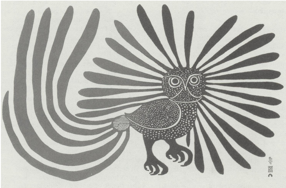
FIGURE 3. Kenojuak Ashevak (1927–2013). The Enchanted Owl (1960). Stonecut on paper. 60.9 cm. x 66 cm.

presumably only visual evidence—undetected when he thought the work was painted by David—that the work was clearly deficient. “Its poetry, literary rather than plastic, its very evident charms, and its cleverly concealed weaknesses, its ensemble made up from a thousand subtle artifices, all seem to reveal the feminine spirit.” 33 This type of devaluing of an art object by a supposedly objective, knowledgeable judge is not an isolated incident. In numerous cases where the aesthetic value is low, there is an implicit judgment about the maker—and his or her lack of artistic qualifications—lurking behind the aesthetic judgment. Originality is opportunistically used to cite Charpentier as a mere imitator, a student of David. Similar accusations have been made against seventeenth-century painter Judith Leyster whose works lost value upon discovery of a brushstroke style which was criticized as imitative of Frans Hals. More recently, Lee Krasner’s reputation suffered because of her being both the wife and imitator of her husband, Jackson Pollock; Elaine de Kooning also fared badly in comparison to Willem.