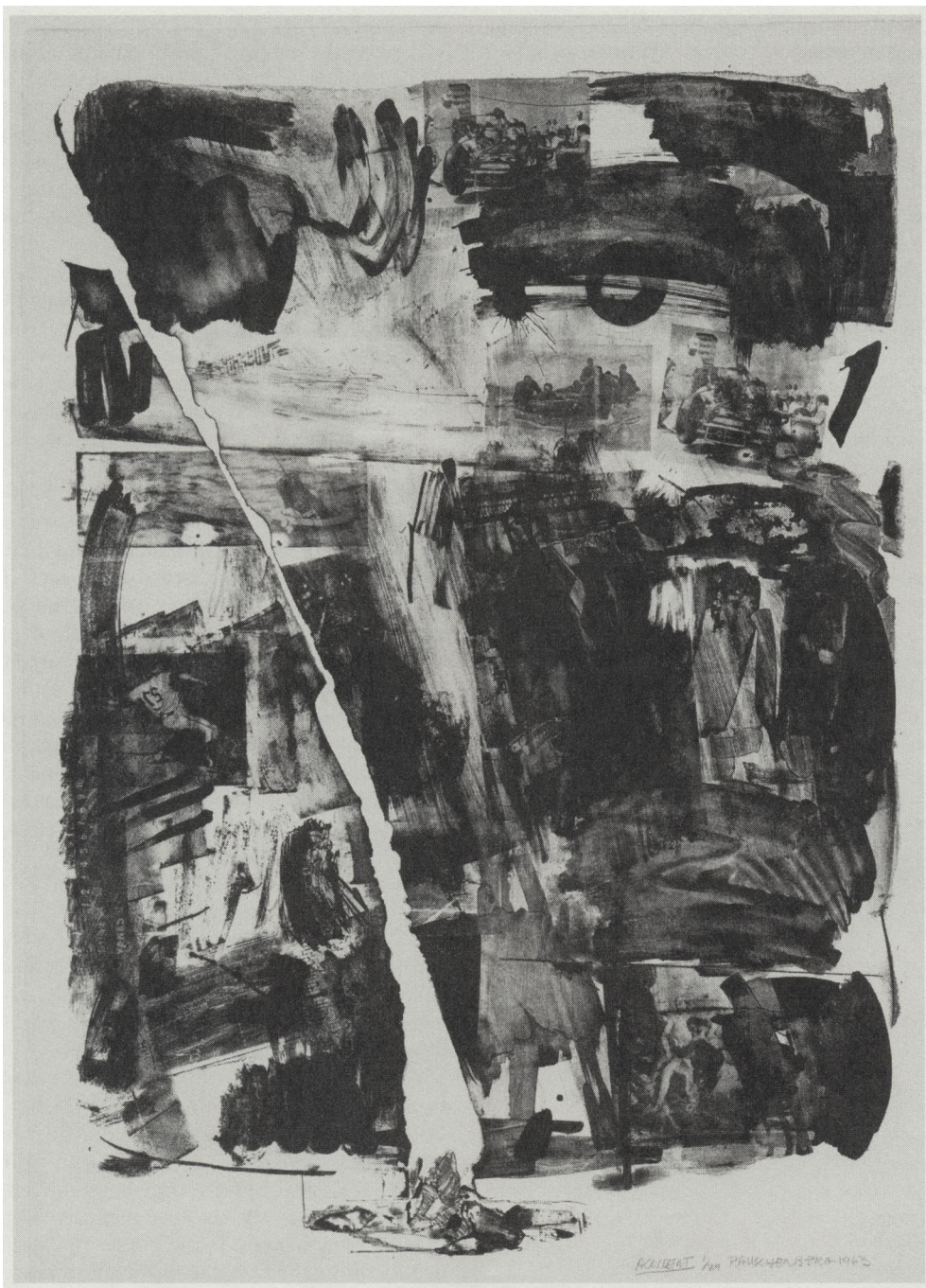
FIGURE 2. Robert Rauschenberg (1925–2008). Accident (1963). Lithograph on paper; sheet: 41 in. x 29 in. (105 × 75 cm). Publisher/Printer: Universal Limited Art Editions, West Islip, New York. Gift of the Celeste and Armand Bartos Foundation. The Museum of Modern Art, New York, NY, U.S.A. Art © Robert Rauschenberg Foundation and ULAE/Licensed by VAGA, New York, NY.