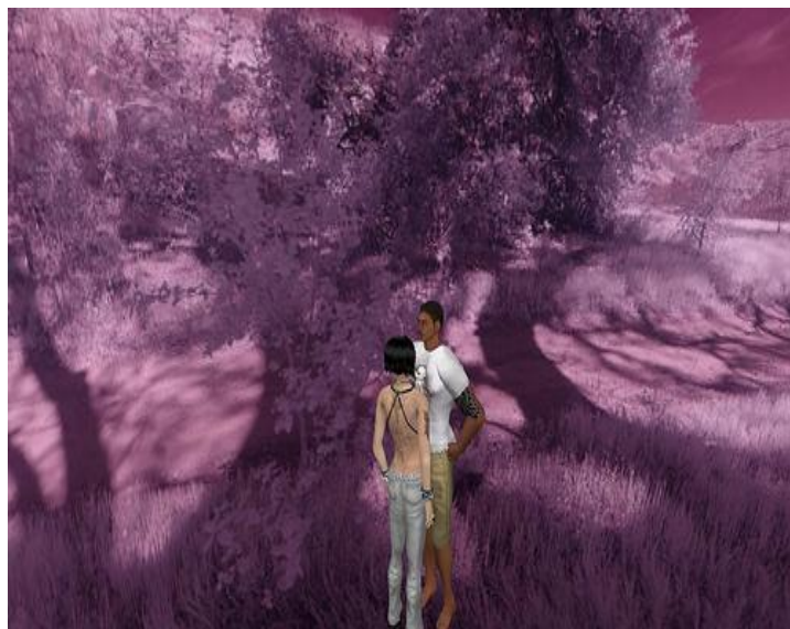
Figure 3. A virtual reality game

So space is not the screen the virtual reality appears on, e.g. the Figure 3 avatars are just pixels, but so is their background. As an avatar moves through the forest, no fixed node-pixel mapping is required, as any screen node can process any pixel, whether of avatar or background. Programmers "move" an avatar image through a forest by shifting all its pixels equally relative to the background, but often prefer to "bit-shift" the background behind the image, leaving the avatar centre screen as he/she "moves" through the forest. A later paper attributes relativistic frames of reference to this. Only for each processing cycle instance does a space pixel "point" necessarily map to one screen grid node. Recall that the grid proposed is not space, time, or space-time, but what creates them .