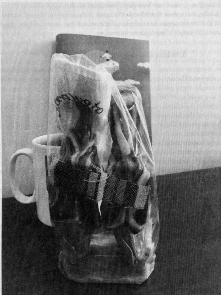
Figure 23.1 Despite the fact that some of the parts of the coffee mug are occluded, the whole mug ‘pops out’ and your experience of it has presentational phenomenology, on Chudnoff’s view.

way to you. You are thereby making a reference to your (alleged) awareness of the truthmaker for ‘there is a coffee mug in front of me.’