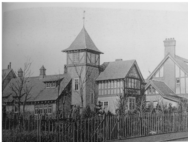
Figure 1. The Bungalow, Penicuik, c.1900.

twentieth century. 7 Other historians focusing on the organisational arrangements and settings for British genetics have demonstrated that, as an emerging scientific discipline, the spaces for genetics research were often domestic and rural rather than metropolitan and institutional (Richmond, 2006; Opitz, 2011). This was partly a result of the fledgling science's arriviste intellectual status and partly the unique spatial and technical requirements of plant and animal breeding experiments (Richmond, 2006, p. 597). Ewart's independent research station pre-figured the "country house" arrangement later adopted at sites such as Whittingehame Lodge in Cambridge and the John Innes Horticultural Institution at Merton Park, Surrey (Opitz, 2011, pp. 80, 90). Yet breeding and genetics in Edinburgh would develop in distinctly different ways. While the latter two centres had their origins in private benefaction, the ABRD would emerge as part of a network of state-supported research institutes (Olby, 1991). This government support would be secured despite the concentration of funds and powerful social networks in the capital and the south-east of England. Moreover, Ewart's work as a zoologist and experimental animal breeder steered the direction of genetics in Edinburgh towards an animal breeding context as distinct from the predominant focus on plant breeding and horti-