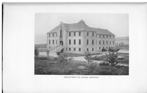
Figure 3. Institute of Animal Genetics building, 1930.

had enlisted in the army that summer, died of cerebral meningitis at Gailes military training camp, aged 37. 76