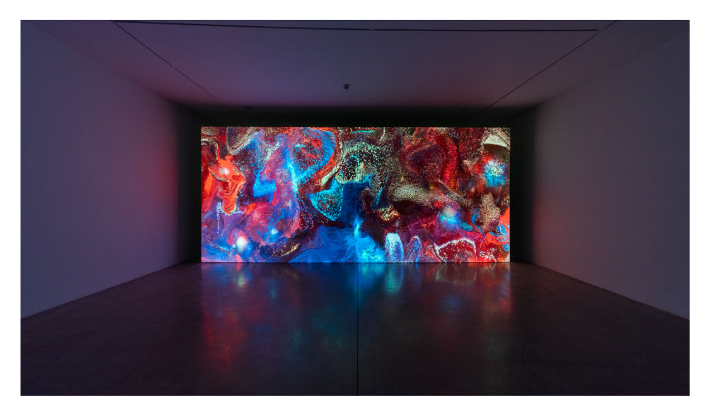
Figure 3. AI DATA SCULPTURE: ISS HUBBLE MRO, 2020-21. Custom software site-specific installation. Duration: 13 minutes 50 seconds. This artwork was displayed at the exhibition "Machine Memories: Space" with artworks by Refik Anadol. This exhibition was held between 19 March and 26 April 2021 at Pilevneli Gallery in Istanbul. At the core of the artworks displayed in this exhibition was the creation of immersive digital worlds that became possible thanks to the use of AI. For more information about the exhibition: https://www.pilevneli. com/exhibitions/38-refik-anadol-machine-memoirs-space-pilevneli-dolapdere/works/ © Refik Anadol.