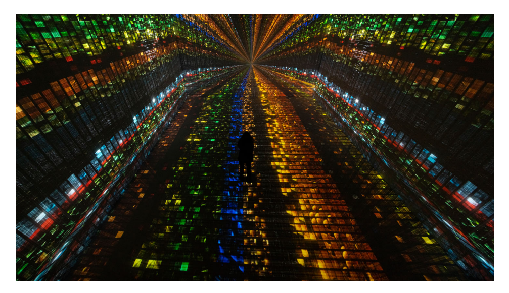
Figure 4. MACHINE MEMOIRS V.2, 2020-21. A/V performance in an18 channel immersive room. Duration: 18 minutes. This artwork was displayed at the exhibition "Machine Memories: Space" with artworks by Refik Anadol. This exhibition was held between 19 March and 26 April 2021 at Pilevneli Gallery in Istanbul. At the core of the artworks displayed in this exhibition was the creation of immersive digital worlds that became possible thanks to the use of AI. For more information about the exhibition: https://www.pilevneli.com/exhibitions/38-refik-anadol-machine-memoirs-space-pilevneli-dolapdere/works/ © Refik Anadol.