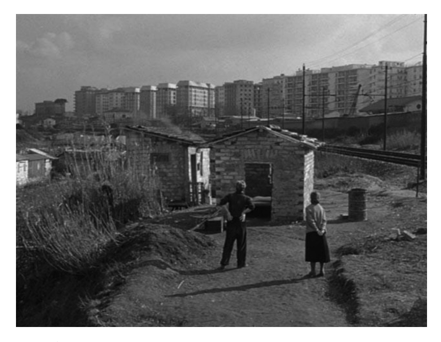
Figure 1. Scene from Vittorio De Sica's Il tetto (1956).