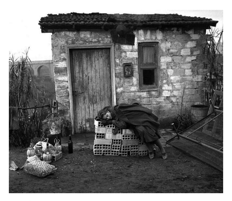
Figure 2. Scene from Vittorio De Sica's Il tetto (1956).