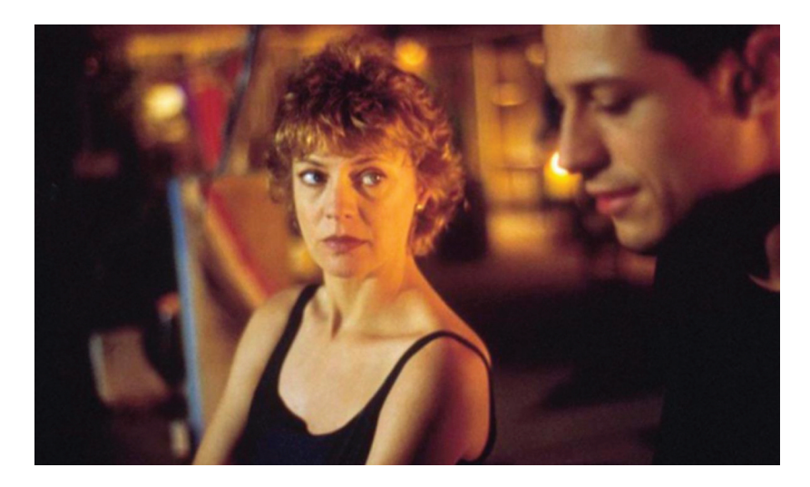
Figure 5. Antonia in Ferzan Özpetek's La fate ignoranti (2001).

feminine figure could also be understood as an allegory of this ambivalence. The ending scene with the couple sharing an intimate conversation that brings to mind the atmosphere of the interior space of a home in front of the skyline of Rome could also be understood as a device that aims to challenge the contrast between the intimacy of interior spaces and the chaotic character of the urban landscape. Through this device, the director manages to convey a new understanding of the emotions related to urbanity.