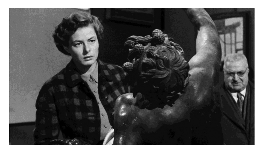
Figure 7. Katherine in Roberto Rossellini's Viaggion in Italia (1953).