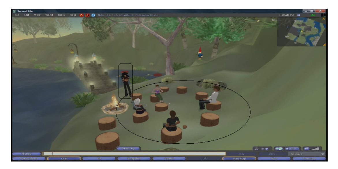
Figure 3 Use of space in Second Life