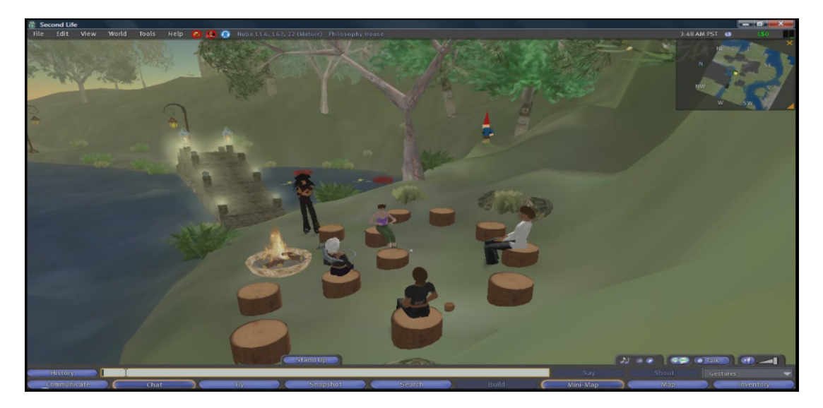
Figure 1 Philosophy Island in Second Life: postgraduate discussion

Karriline Capalini: I think you can give hints of a complex identity - it's not a matter of creataing it but giving some insight into it's existence Kaiser Beaumont: that's the point. i'm not going to create an idenity...i have oine already...my avatar is merely an avatar...a bunch of pixles which enable you alot to locate me in this virtual world