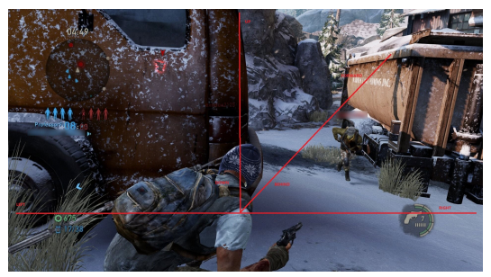
Fig. 2. Another example of egocentric (body-centered) space in a computer game. In spite of third-person view, the point of origin of the space is still the player's body, and during gameplay it is transparent. Indeed, the third-person character is experienced as a prosthetic extension of the avatar, which is the digital body (camera), assimilated in player's body schema, by means of which the user access to the game world.

Third, communication among players in multiplayer mode. For example, in The Last of Us (Naughty Dog, 2013), the players must communicate each others continuously in order to indicate the local positions of supplies or possible dangers, such as enemies or land mines. In this game, the communication among teammates is essential to succeed to avoid possible ambushes or effectuate coordinate strategies. Frequently, the teams move within the post-apocalyptic scenarios as a single agent with a distributed intelligence. Now, while communicating, they use typical coordinates of an egocentric space, and the accuracy by which the 3D space is represented egocentrically is primary to win the match (fig. 2). They say, for instance, that the sniper is in the upper right, the supplies are up ahead, behind a car, or the medkit is located to the left, in front of a sofa. These are coordinates that have as point of origin the player's body. Otherwise, the player could not understand what the teammate are saying, because spatial terms such as "here", "there", "behind", "forward", "up" are specified only like motor dynamics that our body must execute to achieve situated goals.