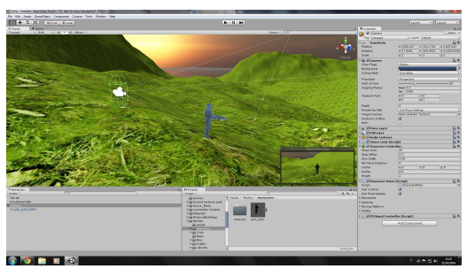
Fig. 4. Another 3-D environment in developing by Unity 3D. As you can see, we have a camera coupled with a 3-D model of the character (camera is behind it). In fact, in Unity the designer can make a game object a child of another one, which means it will move anytime the father will move. The player's perspective is still provided by camera's scope, whereas the character (i.e., child's camera) turns in an its extension.