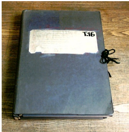
Figure 1: Twardowski’s archive, Library of Warsaw Philosophy Institute

the thoughts Twardowski had a century earlier. Now, the question is that of the nature of the relata. No miracle, of course, is involved, because the relationship between myself, as a material creature, and the products of the mental activity of a philosopher I have never met is mediated by the book. I am physically related to my copy of that book, the inked inscriptions on the book impress my retina, I recognize in those inscriptions familiar words and sentences and, as a competent English-reader, I access the linguistic meaning of those sentences, which delineate the thoughts Twardowski had in his head at the time he wrote them. This is a well-known story: our capacity to access the thoughts of past thinkers is to be decomposed in (i) our perceptual capacity to access the token of the words they drew on paper; and (ii) our linguistic capacity to access the meaning of those words (now considered, not as concrete inscriptions or ‘tokens,’ but as linguistic ‘types’). Nevertheless, crucial details of this familiar story differ, according to whether we are dealing with printed books or digital devices.