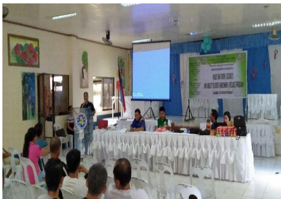
Figure 4. Presentation of the objectives of the program to the constituents

"Disaster Preparedness is needed, as we are experiencing floods in our community and training will be helpful for us." (Community Leader 3).