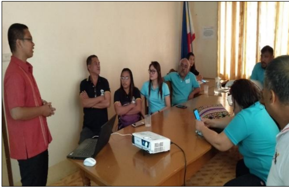
Figure 3. Community leaders' in consultation

Images from the consultation with community leaders and the presentation of the assessment results are shown below. During the presentation of the ten key areas as components of the POSASE Extension Program, the community leaders approved and accepted them. The community leaders shared their thoughts on the proposed community extension program. In the discussion process, the following suggestions and thoughts have been shared: