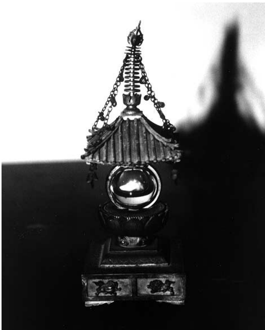
Figure 6. Reliquary containing Emperor Gomizuno-o's tooth (Hōjō-ji collection).