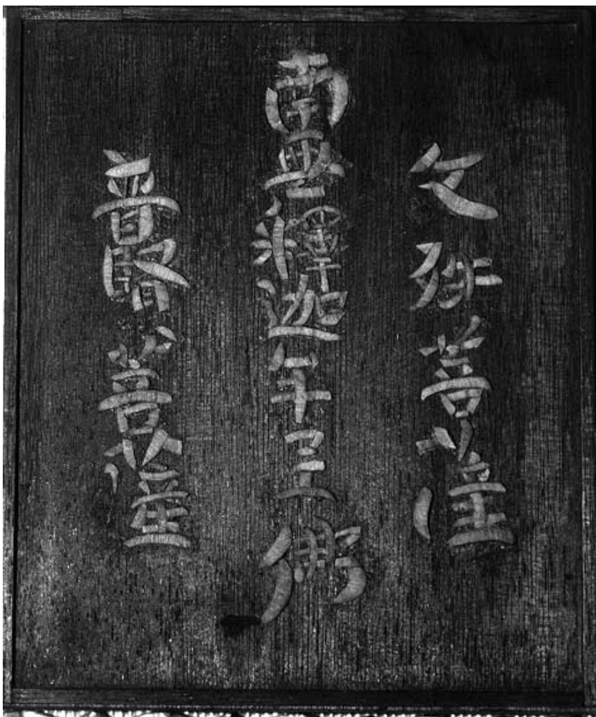
Figure 2. Myōgō created with fingernail clippings (Enshō-ji collection).

which the characters are formed with mother-of-pearl and inlaid in lacquered wood. But I know of no other examples made with fingernail clippings. The fingernail clippings are glued onto wooden plaques, about 13 x 11 cm, which are stored in small wooden shrines, about 24 cm high. Nowadays both are kept in the Enshō-ji storehouse. It is not clear where they would have been placed in Bunchi's time. Both wooden plaques have identical inscriptions written in red ink on the back: