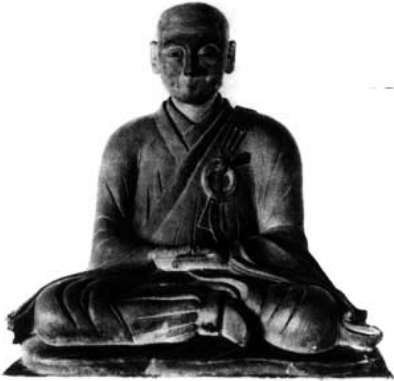
Figure 8. Clay statue of Emperor Gomizuno-o without cloth covering (Enshō-ji collection).

1481. The hair was implanted not just to make the statue more outwardly realistic but to inject Ikkyū's spirit directly into the image (MORI 1977, p. 44). Likewise, ashes or bones were also sometimes deposited inside sculptural portraits. For example, the ashes of the famous monk Nichiren 日蓮 (1222–1282) were placed in a bronze container inside a portrait sculpture (now at Honmon-ji 本門寺 in Tokyo), which was dedicated on the sixth anniversary of his death in 1288 (KURATA 1973, plates #204 and #205). As with the addition of hair, the enshrining of such corporeal relics heightens the physical presence of the image.