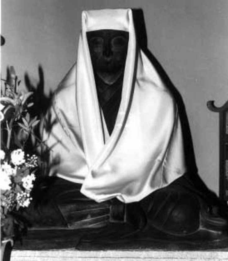
Figure 7. Clay statue of Emperor Gomizuno-o (Enshō-ji collection).

(realistic portraits of Zen Buddhist monks). The custom of enshrining relics inside Buddhist statues can be traced back to India. Numerous examples can be found in Japan (KURATA 1973). The act of commissioning an image and enshrining one's bodily relics within it was thought to be a way of demonstrating devotion and a way of assuring one's salvation.