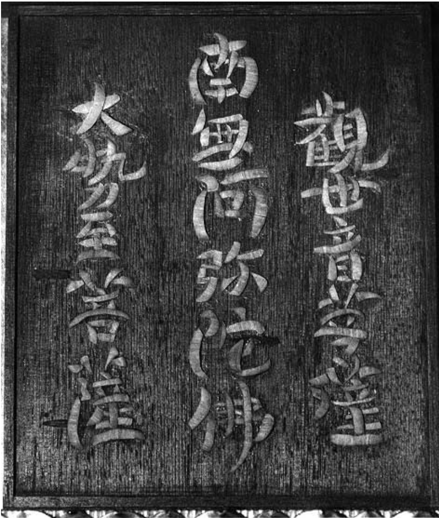
Figure 3. Myōgō created with fingernail clippings (Enshō-ji collection).