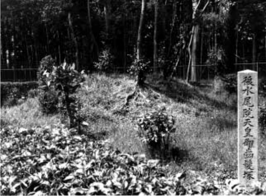
Figure 5. Mound containing Emperor Gomizuno-o's hair and tooth at Shōkoku-ji.

112). The mound is designated as “Gomizuno-o-in Tennō goshihatsuzuka” 後水尾院天皇御齒髮塚 (mound containing the tooth and hair of Emperor Gomizuno-o) (Figure 5). Although the hair of one of his sons and two of his daughters was also placed in the original pagoda, the present-day marker mentions only Gomizuno-o's tooth and hair, because as emperor his relics were obviously considered the most significant.