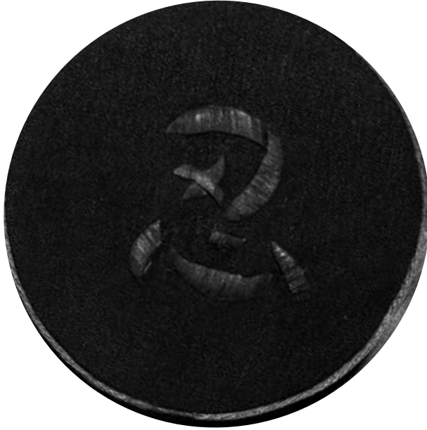
Figure 1. The character 忍 formed with fingernail clippings (Enshō-ji collection).