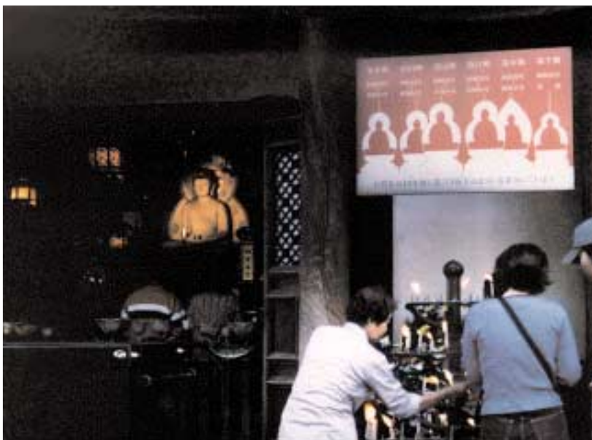
Figure 9. Hall enshrining Amida images made from bones at Isshin-ji.

Osaka. Since the Meiji period, this temple has collected bones from worshipers, pulverized them, then mixed the powder with cement to create images of Amida Buddha. An image is created every ten years, reportedly with bones contributed from approximately two million worshippers. Isshin-ji was burned down in World War II, so now it houses only the six Amidas made in the postwar period. When I asked the priest about the motives of the people contributing bones, he replied that it is a way of venerating the Buddha and, at the same time, it is a memorial to one's ancestors. Moreover, he said that people gain a sense of security from knowing that their bones will become part of an Amida statue, literally uniting with Buddha. The fact that the Amida images are enshrined in a special hall (Figure 9) where they are looked after by the temple and visited by many worshipers is also attractive.