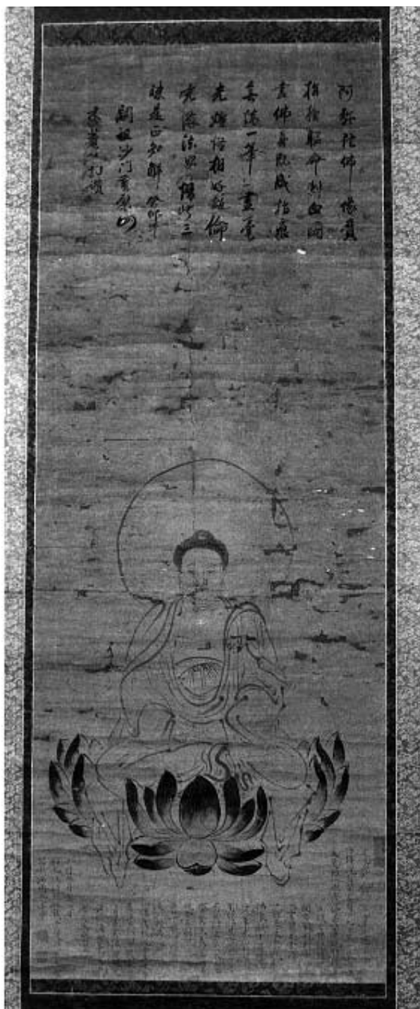
Figure 11. Image of Amida painted with blood by Tetsugyū Dōki (Shōtai-ji collection).