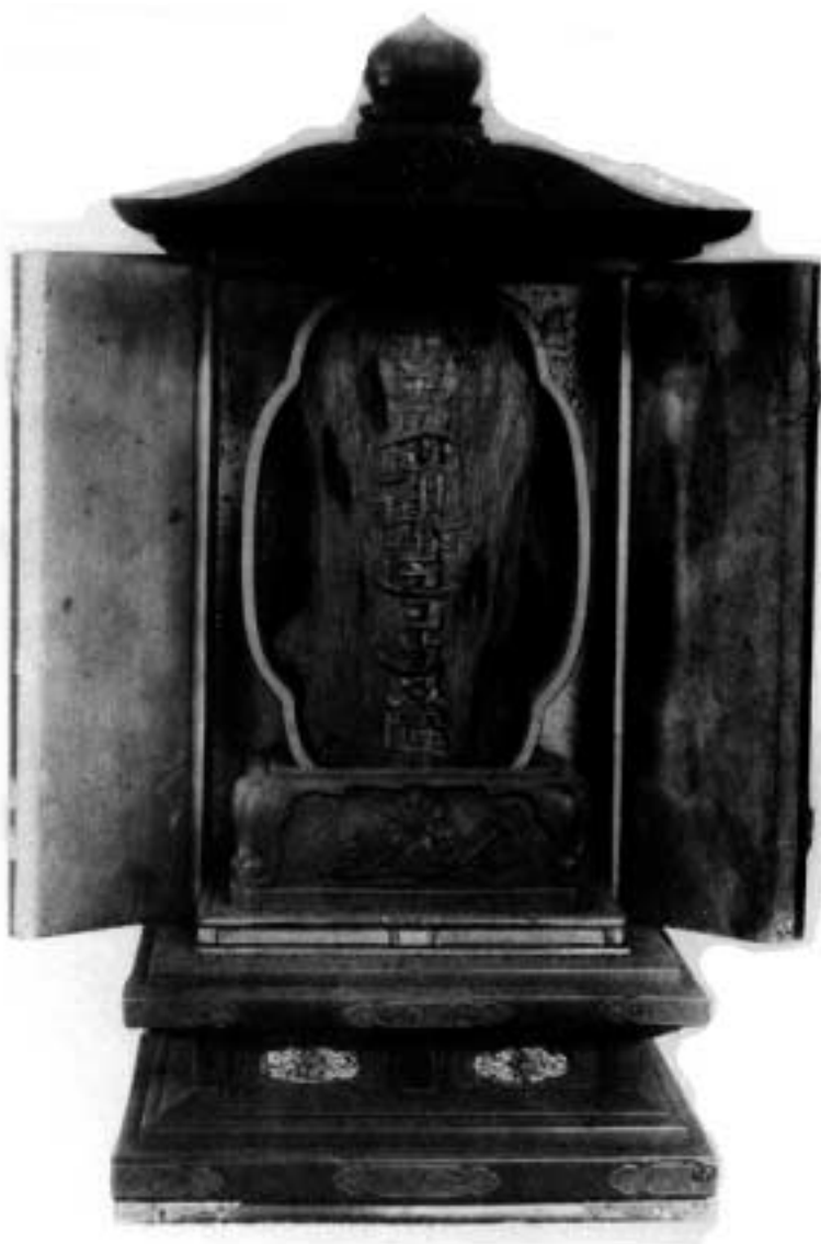
Figure 4. Myōgō of fingernail clippings placed in a bronze pagoda (Myōshin-ji collection).

Myōshin-ji 妙心寺 in Kyoto. Housed within an impressive dark bronze pagoda-like shrine is a small wooden shrine, within which is a slightly irregular piece of sandalwood to which are glued Gomizuno-o's fingernail clippings, forming one line of characters reading Namu Shō-Kanzeon bosatsu 南無聖觀世音菩薩 (Figure 4).