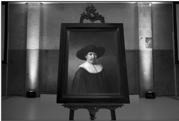
Fig. 2 The Rembrandt that is not a Rembrandt. Microsoft Project with the Rembrandt House Museum

Analysing the known works of Rembrandt, an algorithm identified the most common subject (a portrait of a Caucasian man, 30–40 years old), the most common traits (facial hair, facing to the right, wearing a hat, a collar and dark clothing, etc.), the most suitable style to reproduce these characterising properties, the brushstrokes, in short, all the information needed to produce a new painting by Rembrandt. Having created it, it was reproduced using a 3D printer, to ensure that the depth and layering of the colour would be as close as possible to Rembrandt’s style and way of painting. The result is a masterpiece. A Rembrandt that Rembrandt never painted, but which challenges our concepts of “authenticity” and “originality”, given the painting’s strong link with Rembrandt himself. I do not know the value of the painting. My bet is that it would be quite expensive if it were auctioned as reliably authenticated as that unique Microsoft’s Rembrandt.