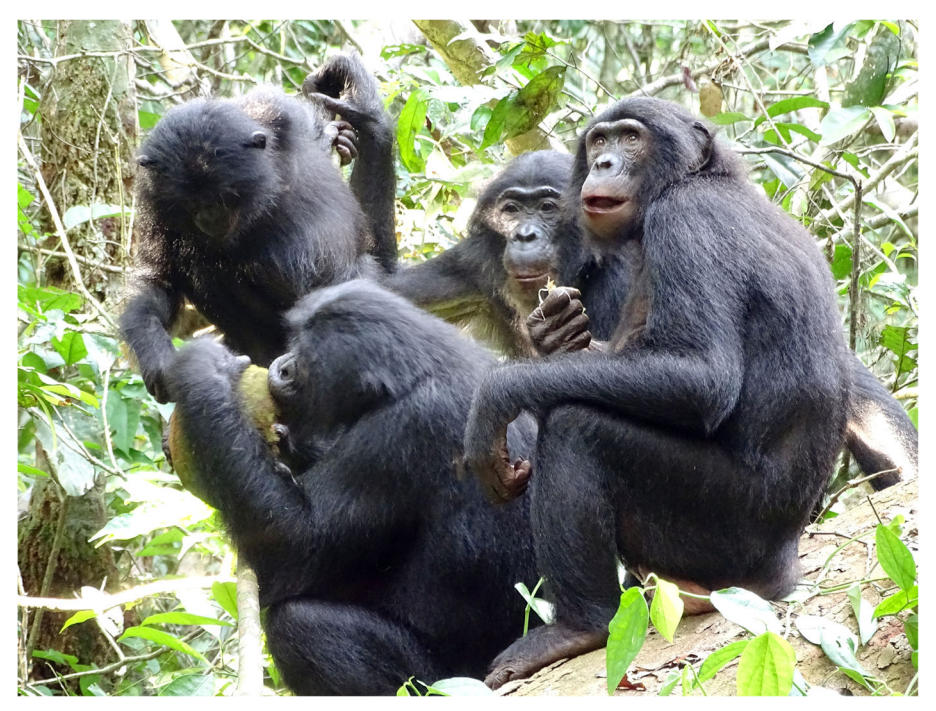
Fig. 2 African breadfruit ( Treculia africana ) sharing: a party is gathered around the owner (in this case, a male).