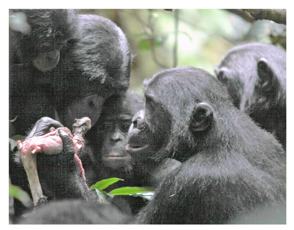
Fig. 1 Peering for a piece of meat, bonobos gather around the owner of a duiker's leg