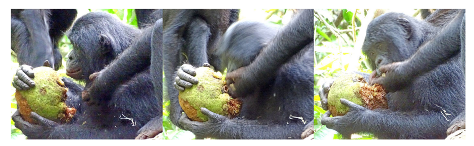
Fig. 3 The owner of an African breadfruit rips off a piece with his teeth and transfers it into the open palm of the beggar