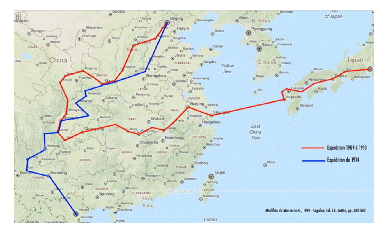
Figure 3. The journeys of Segalen through China<sup>31</sup>

But how is such a thing possible? How can there be a trans-religious political theology of the scholar? When scholars meet together when they write, they address themselves to one another across boundaries. They address themselves to the future. Perhaps this is not a secular eschatology (as hinted at by Derrida), but one refracted through many cultural and religious prisms.