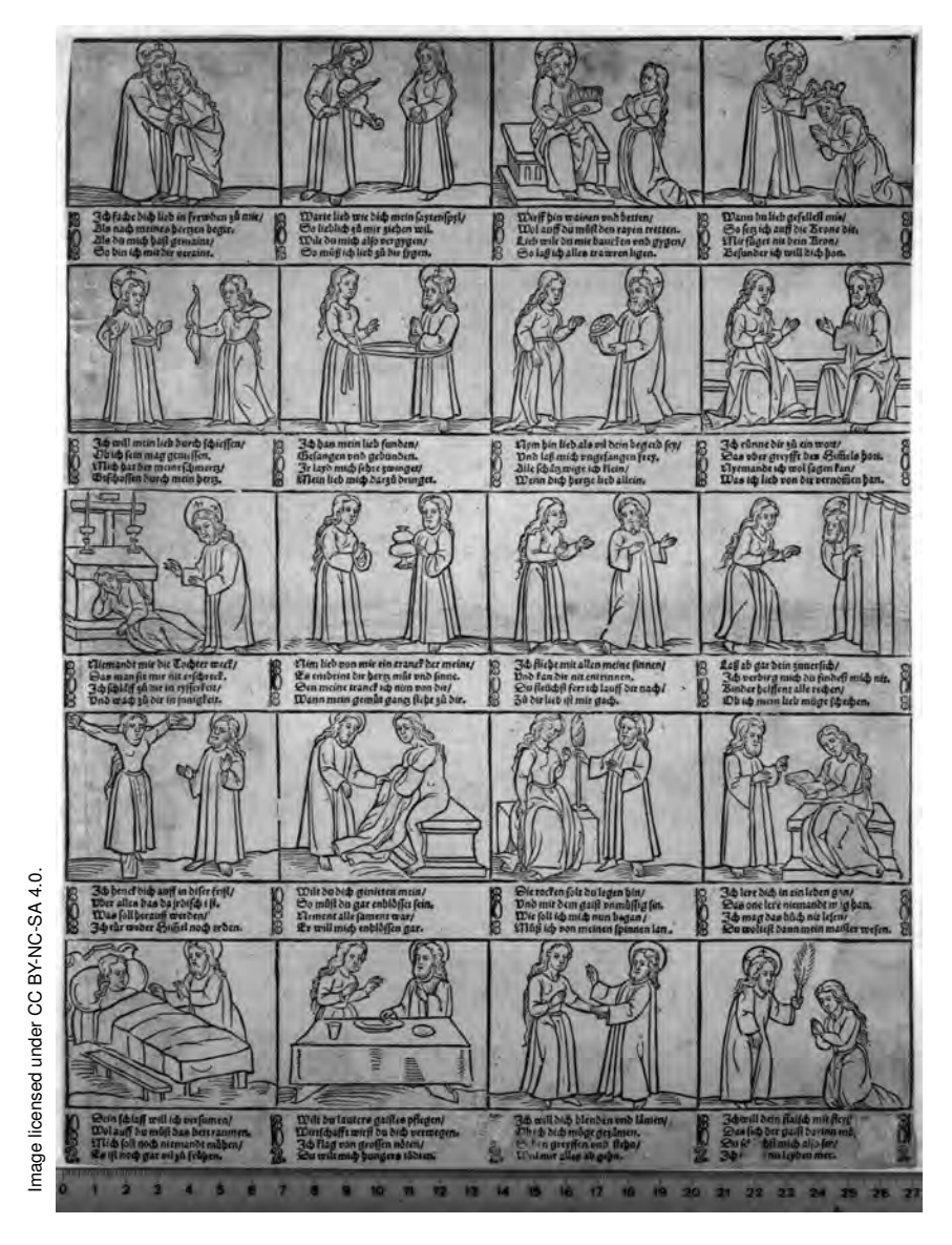
Figure 1: The M Broadsheet