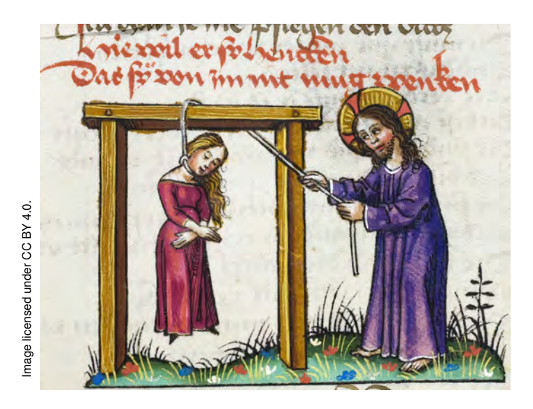
Figure 2: Hanging (from Manuscript D, f. 19r)

in which Christ hangs the bride to the point of near-death (Figure 2).<sup>22</sup> Now literally suspended between heaven and earth,<sup>23</sup> the Soul gives up her attachment to earthly life with Christ's assurance that she will not be lost.<sup>24</sup> Using the same words with which he lulled the bride to sleep in the prologue, he now encourages her to close her eyes to the world and assures her that he will be the one to awaken her.<sup>25</sup>