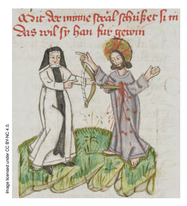
Figure 3: Wounding (from Manuscript E, f. 13v)