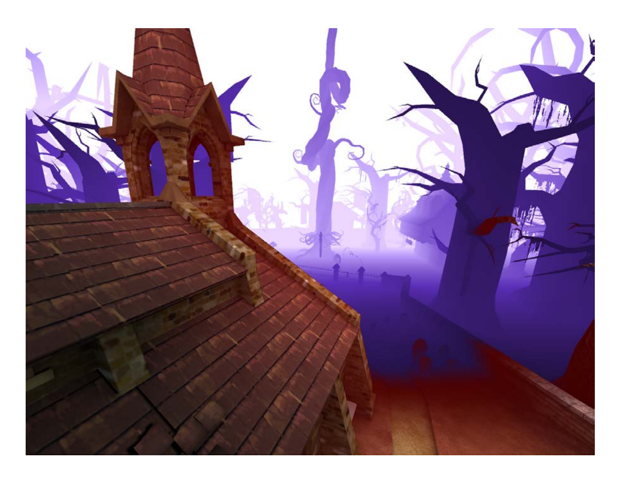
Figure 2: A screenshot of Technically Finished 's 2009 video game Haerfest , showing a first-person simulation of the combination of a bat's short eyesight and one instance of its echolocation system (used with permission).

In the conclusive passages of Nagel's essay, he contended that humans have no way yet of objectifying an alien world-view and, as a consequence, no way yet of knowing what such experience is like from the point of view of neither phenomenology nor neuroscience. On top of that, Nagel further observed, such experiences would not be anything like the experiences of those animals without the possibility of fundamentally altering human subjectivity; such a shift would, however, inevitably require a drastic modification of human biology. For the reasons advanced in What Is it Like to Be a Bat ? it should be apparent that Haerfest cannot offer a phenomenologically defensible account of the experience of what it would be for a bat to be a bat. Haerfest is a technological artefact, the materialization of a world that was designed by humans to be engaged by humans and that is mediated by a machine characterized by logics which are simplifications, extensions, distortions and repetitions of certain aspects of a human kind of sensibility and cognition<sup>xvii</sup>.