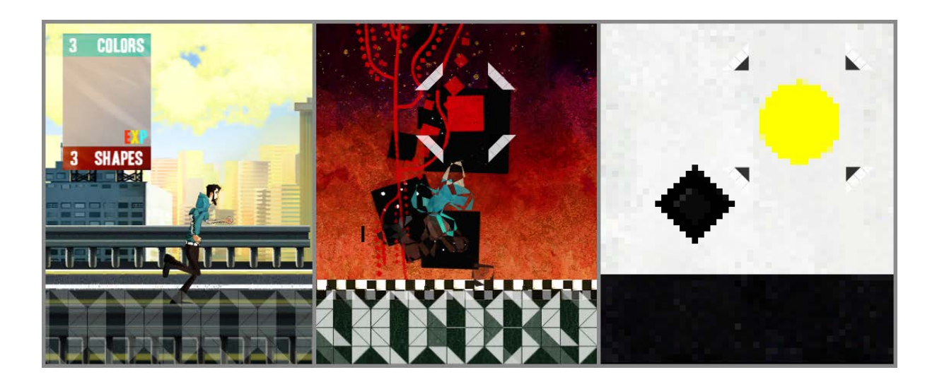
Figure 3: Three images taken form screenshots of the PC game EXP, showing three different moments in the progress – and degradation – of the gameplay experience (used with permission).

video game EXP the player is exposed to a persistent and interactive world whose phenomenology, together with that of Poole's own experimentation, undergoes an objective process of degradation and subtraction that eventually renders the very formal structure of the game meaningless (see figure 3).