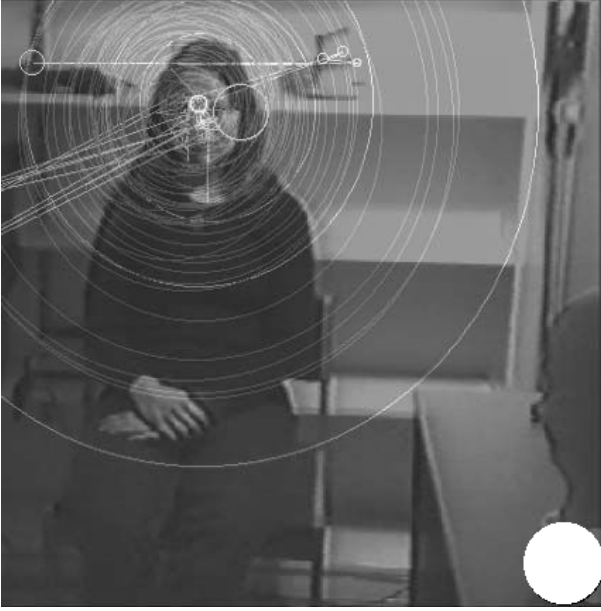
Figure 4. The saccades, fixation locations, and fixation durations of an addressee looking at a speaker. The diameter of the circles indicates the duration of the fixation. The fixation comparison point in the bottom right corner equals one second.