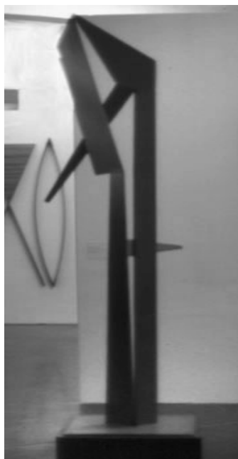
6. Pietro Consagra, Totem della liberazione , 1947, painted iron, 210 x 43 x 64 cm., artist's collection, Rome.

order to achieve «a higher dramatic effect» 21 and they are also arranged in enigmatic forms, organised according to an interplay of masses and voids. The arbitrary relationship between the Liberation, the precise geometric composition and the semantic inscrutability of the metallic construction puts forward a political statement: despite all expectations to the contrary, it is impossible to find a widely shared language capable of securing a reference to the contemporary social and political situation. (Illustration 6)