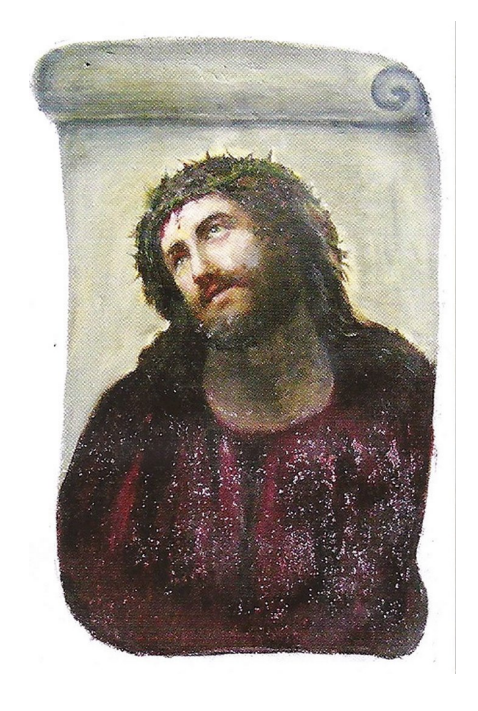
Figure 2: Ecce Homo prior to "restoration"

Firstly, on conservation. In appreciating that awareness of the human past is a eudaimonic good, we are led to valuing phenomena that can promote an awareness of the human past, including scientific awareness of the human past. For the archaeologist, the loss of an article of human heritage, be it from decay or destruction, is an irreparable loss of something they could have used to fill the blanks in the scientific account of the human past. When we hear stories of iconoclasts destroying examples of human heritage, or tales of some well-meaning amateur taking it upon themselves to restore some artefact, it is right that we view this with moral controversy, for their actions have led to the irreparable loss of something that is good for the human animal. The woman who elected to "restore" an antique portrait of Christ in Zaragoza (see below) before deciding it was perhaps best to have left the job to a more qualified individual, did more damage than merely ruin a painting; she made it that this piece of heritage will likely never be restored properly. More than that, she also contaminated the portrait with her own paints, complicating any future archaeologist's research on the artwork<sup>41</sup>.