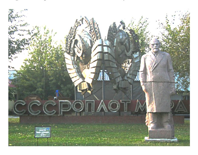
Figure 5: Monuments in "The Fallen Monument Park" in Moscow<sup>73</sup>

prominence and put into "soviet parks" (see figure 5, below) (Harrison, 2013, pp 194-196). This was done by the various states' governments so as to ensure their citizens can access the eudaimonic good that is knowledge of the past, but are not constantly forced to dwell on the traumatic past.