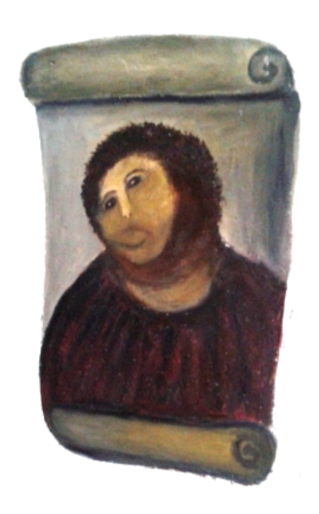
Figure 3: Ecce Homo after "restoration"42