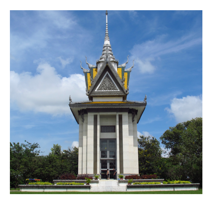
Figure 4: Choeung Ek Memorial<sup>71</sup>

By "proportionally" I mean in a manner that motivates them to being a endaimonic force: one does not demonstrate virtue merely by being emotional at parts of the past. Imagine four tourists went to Choeung Ek (see below). This is a memorial to the victims of the Khmer Rouge, a shrine that contains over 5,000 skulls exhumed from one of the mass graves of the Khmer Rouge's infamous Killing Fields. The four tourists are told of the history of the Khmer Rouge's genocides, and each reacts differently.