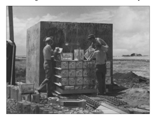
Figure 2: Empty 5 gallon cans being stacked against a blockhouse wall on Enewetak Atoll prior to an Operation Sandstone nuclear test in 1948. The degree to which the cans were crushed by the extreme pressures created by the explosion provided data on the blast's magnitude.

Beyond the reinforced concrete blockhouses built at the PPG and Nevada Test Site, some of the other objects considered to be enduring within the proposed dichotomy include massive cubes of solid concrete used to measure the physical force of a nuclear blast by their movement, concrete walls employed as collimators to channel neutron particles for detection and measurement, and concrete enclosures used to protect cameras from intense heat and radiation during a nuclear explosion. While not essential to being enduring, the above examples derive much of their durability from being constructed of concrete, which also gave them substantial mass. Non-expendable objects