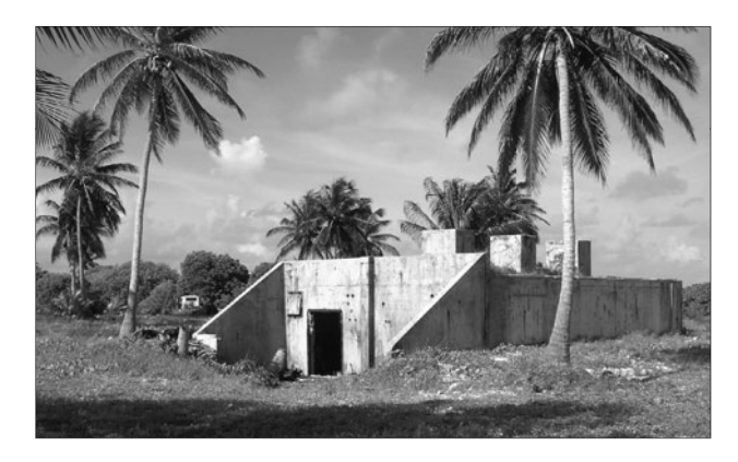
Figure 7: Reinforced concrete blockhouses, such as this former electrical generator building on Eneu Island at Bikini Atoll, often took numerous forms. The two wing walls extending from the building's front face allowed for sand to be mounded up against and on top of the structure for increased protection from explosive damage and radiation.