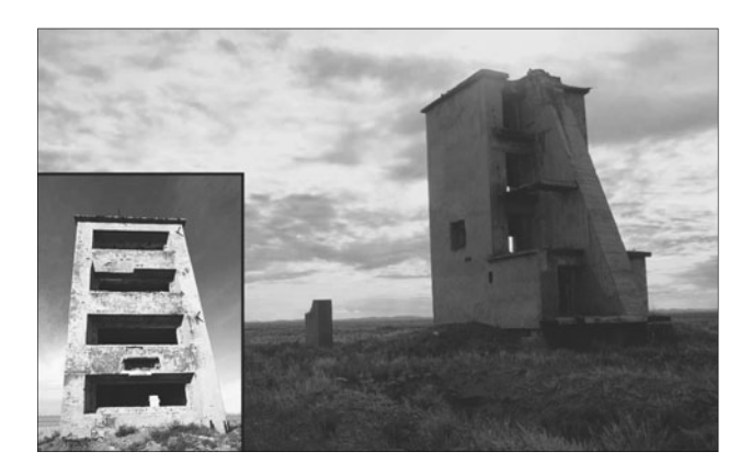
Figure 6: Front (left) and rear (right) views from 2013 of a reinforced concrete scientific station at the former Soviet nuclear weapons testing site at Semipalatinsk in Kazakhstan.