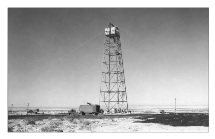
Figure 3: July 1945: the atomic test tower at Trinity Site in New Mexico.

The use of towers in nuclear weapons testing began with the test of the first atomic bomb in July 1945 at a remote section of New Mexico's Jornada del Muerto , which was known thereafter as the Trinity Site. However, over the course of the Cold War test towers would be neither uniform nor ubiquitous in their use, design, or height. During the period from 1946 to 1962, only 56 of the United States' 206 aboveground nuclear weapons tests were staged on towers.<sup>6</sup>