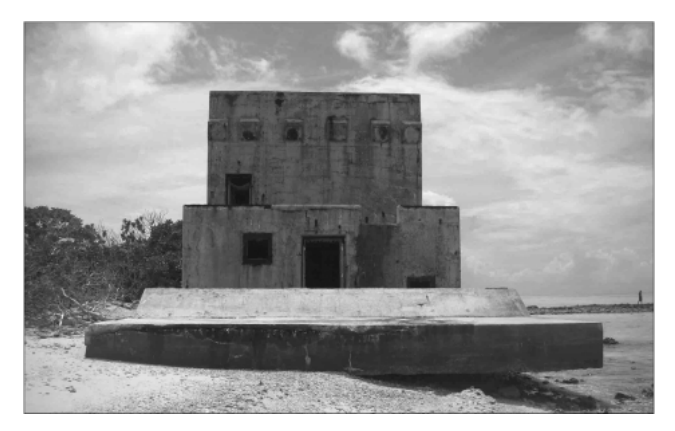
Figure 1: Scientific Station 2300 at the Bikini Atoll lagoon's edge in 2009.

In the Republic of the Marshall Islands, on the Bikini Atoll island of Airukiraru, a relic of American Cold War nuclear weapons testing stands precariously on the lagoon shoreline. Built in early 1954 for use in Operation Castle, the concrete blockhouse dubbed Station 2300 (Figure 1) avoided immediate nuclear destruction multiple times by virtue of its virtual indestructibility. Yet over the past sixty years, the erosional actions of wind, waves, and tide have moved the Airukiraru shoreline more than 100 meters inland threatening to do what the most destructive forces ever wielded by mankind could not: reduce it to rubble. When the end comes for Station 2300, fewer than a dozen nuclear weapons testing blockhouses will remain on Bikini Atoll's historic Cold War landscape.