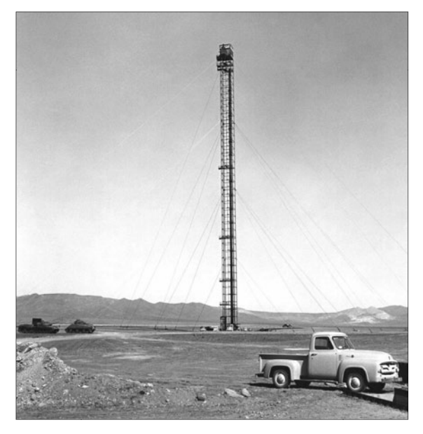
Figure 4: One of the zero towers used for Operation Teapot in 1955 at the Nevada Test Site.

Designed and erected by Holmes & Narver, Inc. (H&N), a Los Angeles engineering and construction firm hired by the United States Atomic Energy Commission to construct almost all United States Cold War nuclear weapons testing structures at the Pacific Proving Grounds and the Nevada Test Site, the three or four-legged towers were fabricated with 6-meter-wide triangular or square cross sections in 7.62-meter lengths and shipped to ground zero for erection. Even with a 92-meter-high tower weighing as much as 45,000 kilos, towers could be erected in weeks, but construction was often intentionally halted after some initial groundwork to prevent possible damage to a completed tower from other nuclear testing in the