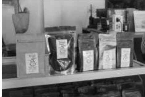
Figure 4. Examples of Toraja coffee variant products produced by Toraja farmers