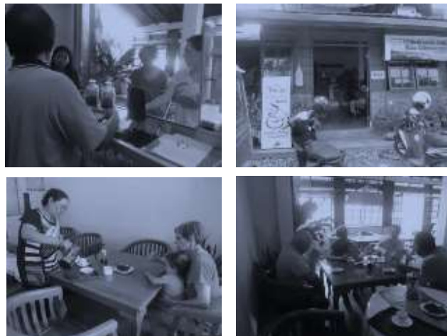
Figure 5. Foreign tourists enjoying Toraja coffee

The value of the benefits of Toraja coffee as a destination felt and perceived by foreign tourists is one of the reasons for their attraction to visit. In addition to enjoying Toraja coffee directly from the source and also a souvenir. As many as 30 foreign tourists delivered their perceptions and expectations (table 3). Of the six discussion topics, their perception of the destination of Toraja Coffee that is most desirable is to visit the coffee plantations and observe the daily activities of Toraja coffee farmers. Their reason is to get new experiences that they have never found and felt.