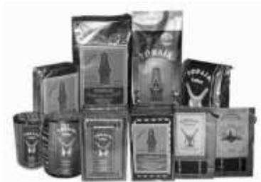
Figure 3. Example of Toraja Coffee product packaging that uses the Toraja house icon.

Various Toraja Coffee brands on the market use the traditional Tongkonang home drawings on product packaging.