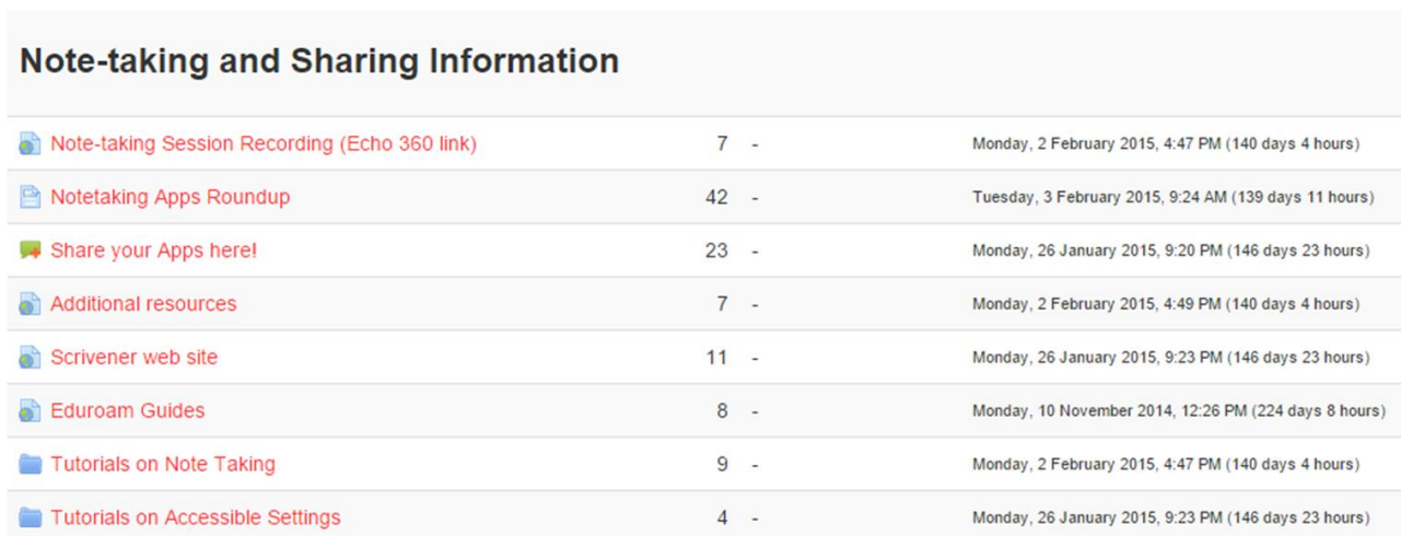
Figure 1. Example breakdown of statistics showing downloads of note taking materials.

There was evidence to suggest that disabled students at the LSE preferred to access materials via an LMS rather than attend a separate course for students with similar educational needs. Statistics on access to the LSE’s LMS also appeared to show a more varied image of preferences for training when they could access the training material independently. The most hit link was that on note-taking apps. In all three session pages, video recordings (Echo-360 recordings) of sessions were also on average more popular than the MS PowerPoint tutorials.