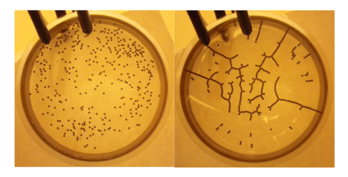
Figure 1: The initial state (left) and the limiting state (right) of a particle agglomeration process driven by a high-voltage current. The order is increasing, because the initial state is random.