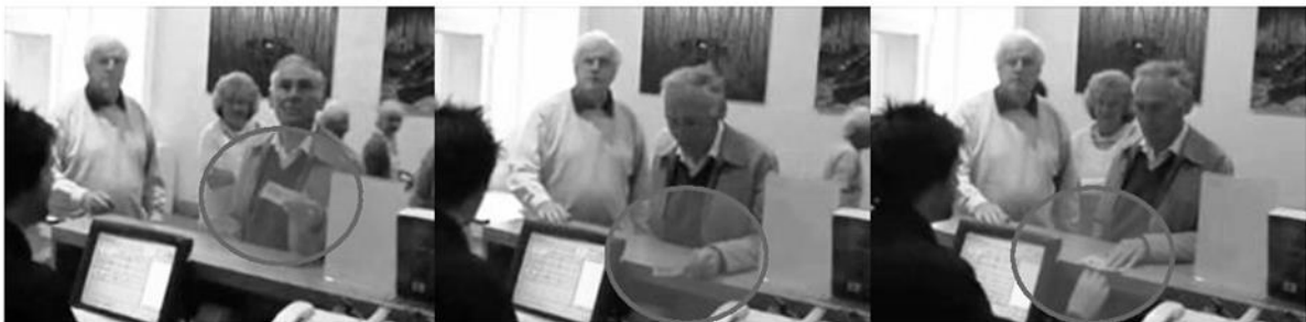
Note held out following order