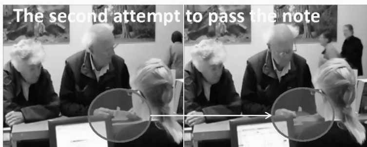
As the E says ‘six’ (line 1), C passes the note towards her with his left hand.

1 E: that’s six pounds. >sorry< (.) thirteen 2 twenty you need to pay then [ please, 3 C: [ thank you 4 you very much.