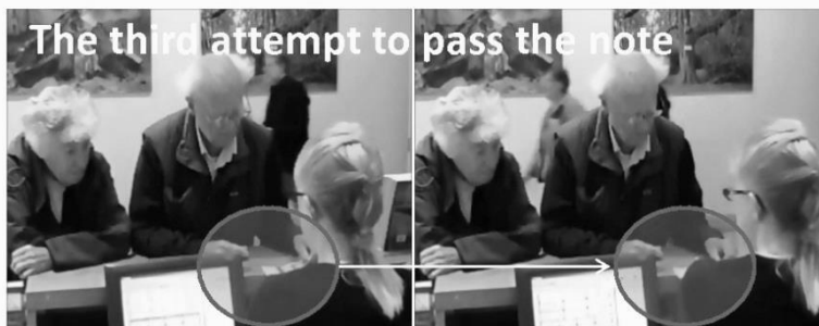
Two seconds later, the note is now on the counter. As the E says ‘please’ (line 2), C nudges the note towards her with his left hand .