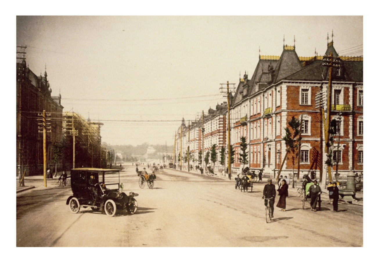
Figure 1 : Marunouchi Headquarters for the Mitsubishi zaibatsu , 1920

<u>Zaibatsu</u>, which means "wealthy clique" in Japanese, is any of the large capitalist enterprises of Japan whose influence and control were pervasive from the Meiji period until the end of WWII [5]. A <u>zaibatsu</u> is usually organized around a single family and might operate companies in nearly all important areas of economic activity. Tajima [5] also postulated that all <u>zaibatsus</u> owned banks and used them as a means for mobilizing capital. The four biggest <u>zaibatsus</u> were Mitsui, Mitsubishi, Sumitomo, and Yasuda, but there were also many smaller <u>zaibatsus</u>.