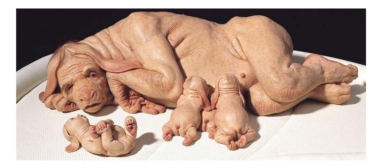
Picture 4: Patricia Piccinini, "The Young Family", sculpture created for Venice Biennale 2003

Artist Patricia Piccinini has used such imagery in her work for the Australian pavilion at the Venice Biennale 2002 ("We are Family").<sup>119</sup> Among other exhibits, one especially striking live-sized sculpture titled "The Young Family" depicts a mother-creature – an eerily hyperrealistic mixture of human and pig – which idyllically suckles three demonstrably cute, pinkish human-pig babies (see Picture 4).