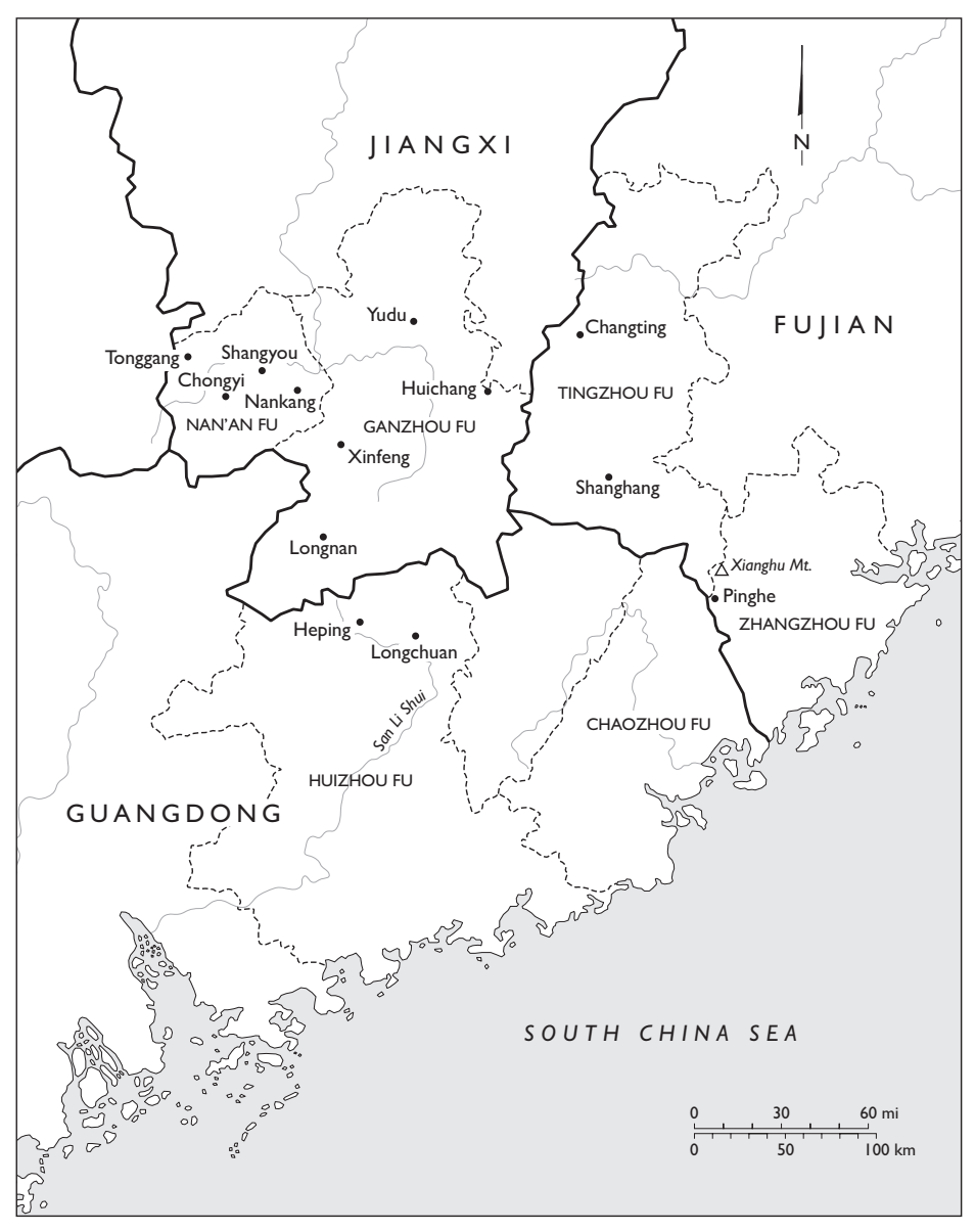
MAP 1 Principal locations for WangYangming's campaigns while he served as grand coordinator of Southern Gan, 1517–1518.