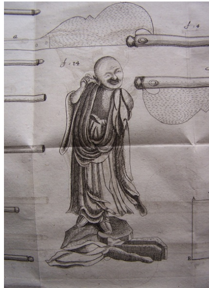
Figure 2: Courten's Chinese figurine, Philosophical Transactions , 1698: ©Royal Society.

Virtuoso: Fie! No. It's a 'Chinese figure, wherein is represented one of that nation, using one of these instruments (that is an ear-picker) and expressing great satisfaction therein...'