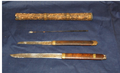
Figure 3: The extant contents of the China cabinet: ©Trustees of the British Museum.

What I want to emphasize here, against a brilliant tradition of reflection on the meaning of collecting that includes Walter Benjamin, Roland Barthes and Jean Baudrillard, is not the agency and personality of the