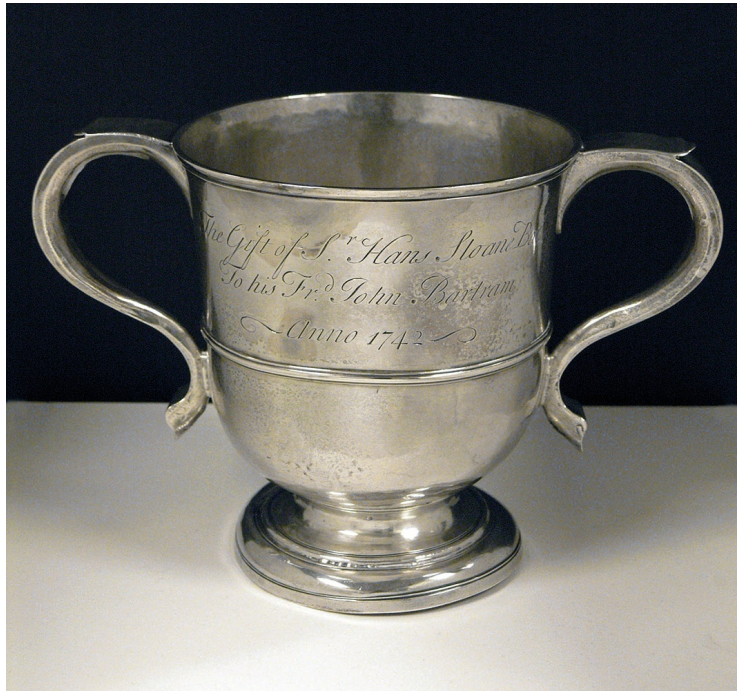
Figure 5: The silver cup “given” to John Bartram by Sloane in 1743

this work, he required assistants, agents and mediators to manage them, since he devoted most of his time to his medical practice and the many offices he held.