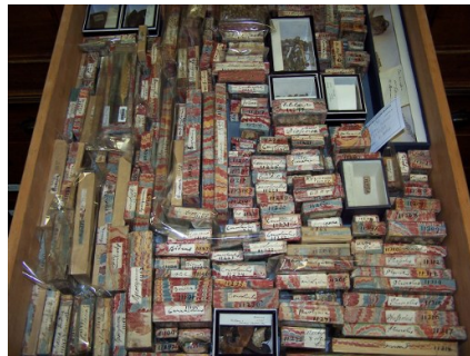
Figure 6: A sample of Sloane's Vegetable Substances collection: Department of Botany, Natural History Museum, London.

Sloane would not have known the utility, profitability or often even the identity of much of what he received. Most natural specimens were not, after all, cochineal, cinchona or cacao. But he accepted the gifts aimed at