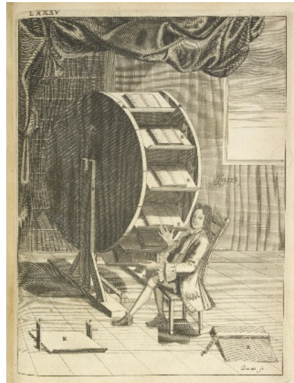
Figure 4: An eighteenth-century book-wheel, one of which Sloane owned and used, as depicted in Grollier de Servière, Recueil d'Ouvrages Curieux de Mathématique et Mécanique (Lyon, 1719)